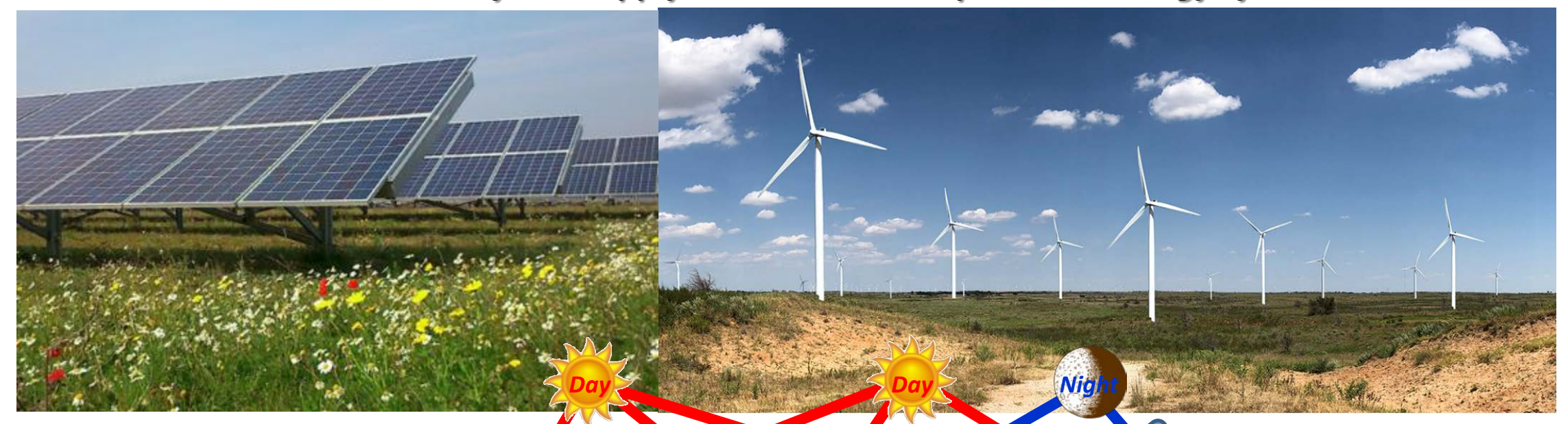
Requires Integrated Energy Management