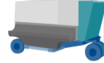
Mobile and Ground Power Units