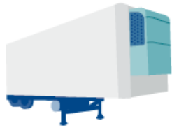
Transport Refrigeration Unit (TRU)