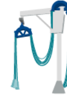
Shore Power Cable Systems