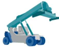
Container Handling Equipment (CHE)