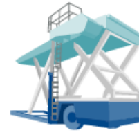
Air Port Cargo Loader