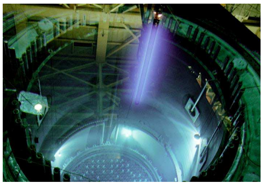
A nuclear fuel assembly being removed from the reactor at the Columbia Generating Station in Richland, WA during a refueling outage. The blue glow results from Cherenkov radiation, emitted as subatomic particles from the fuel move through the water faster than the phase velocity of light.

"This record run is about keeping our commitment to the region to produce clean, reliable and cost-effective power for the long-term," said Mark Reddemann, CEO of Energy Northwest.