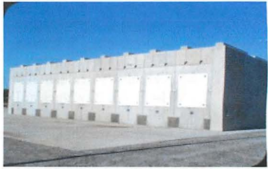
Illustration 1: Areva NUHOMS system

12 https://www.nirs.org/reactorwatch/security/nasrptsfp6.pdf -- "Dry cask storage and comparative risks." NIRS.