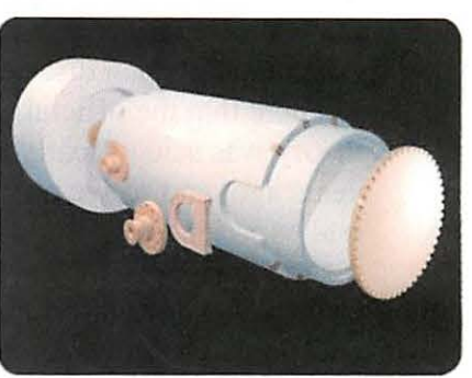
Illustration 5: Areva MP197HB Transport Cask for the NUHOMS system

17. Dual-Purpose Canisters. Spent Fuel Canisters today must be "dual-purpose," which can allow both storage and transportation without removing the fuel assemblies from those canisters. Thin-walled canisters such as the Areva or Holtec systems use a transportation overpack<sup>23</sup> which the manufacturers claim is designed to endure design-basis accidents without radioactivity releases<sup>24</sup>. (Not all canisters are dual purpose. The canisters and underground Holtec system used at the Humbolt Bay Power Plant may be too large to transport, although some references state the opposite.<sup>25</sup>) The thick-walled CASTOR design does not use an overpack per-se, but crushable ends are added for transportation, and are themselves transportable.