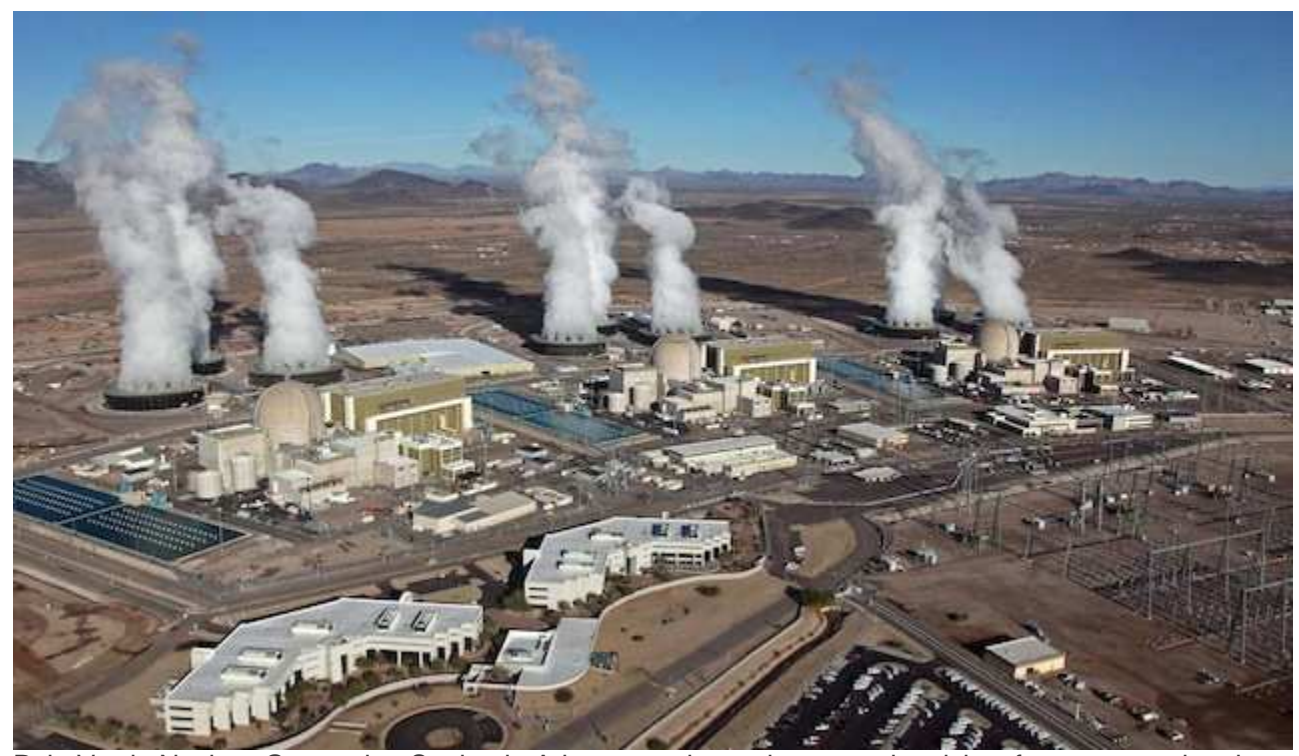
Palo Verde Nuclear Generating Station in Arizona produces the most electricity of any power plant in America, over 30 billion kWhs per year. In 2014, it ran almost 24-7, with a capacity factor of 98% (cf = energy actually produced divided by the maximum possible). No other energy source but nuclear approaches a cf of 90%, and most are under 50%.

But the real measure is what the power plant actually produces over the year. The difference between these two measures is what's known as the capacity factor (cf). The cf is equal to what the plant, array or farm produces in kilowatt hours (kWhs) per year divided by what it could produce if it ran at capacity, 24 hours a day, every day for the entire year. (A year has 8,766 hours, and we like to use kWhs for production since that's what shows up in everyone's electric bill at the end of the month.)