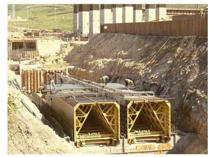
Robust Construction of DCPP twin cooling water tunnels noted by Bechtel during Nov. 18, 2014 meeting

Note the massive foundations, thick rebar, and massive concrete walls, with the humans in the picture for scale. Many critical safety systems are either embedded in the walls or placed close by. Thus, demolition to add cooling towers will be much more lengthy and expensive.