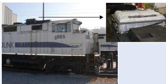
Figure 1: Compact SCR catalyst assembly installed in SCAX 865