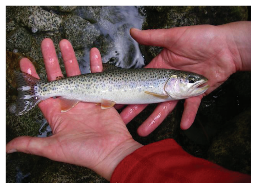
Cutthroat trout – caught on a barbless hook and released – above the anadromous barrier in Ramona Creek, where the proponent claims there are no fish.

"The fish and invertebrate communities in Ramona Creek are likely adapted to life in clear-water conditions, making