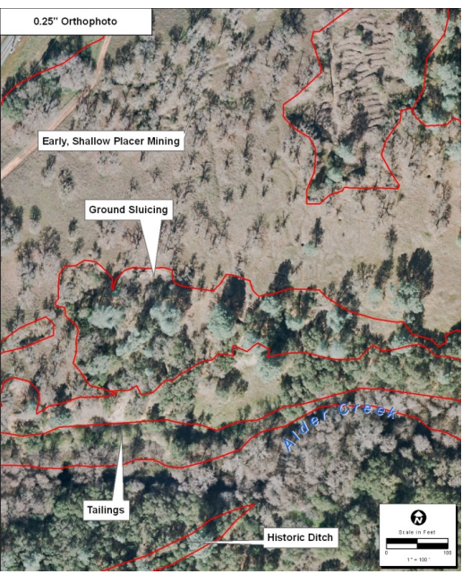
EXHIBIT 624. LIDAR imagery (left) compared to aerial imagery. Notice the clearly visible areas of ground sluicing and early shallow, placer mining, as well as the ditches.