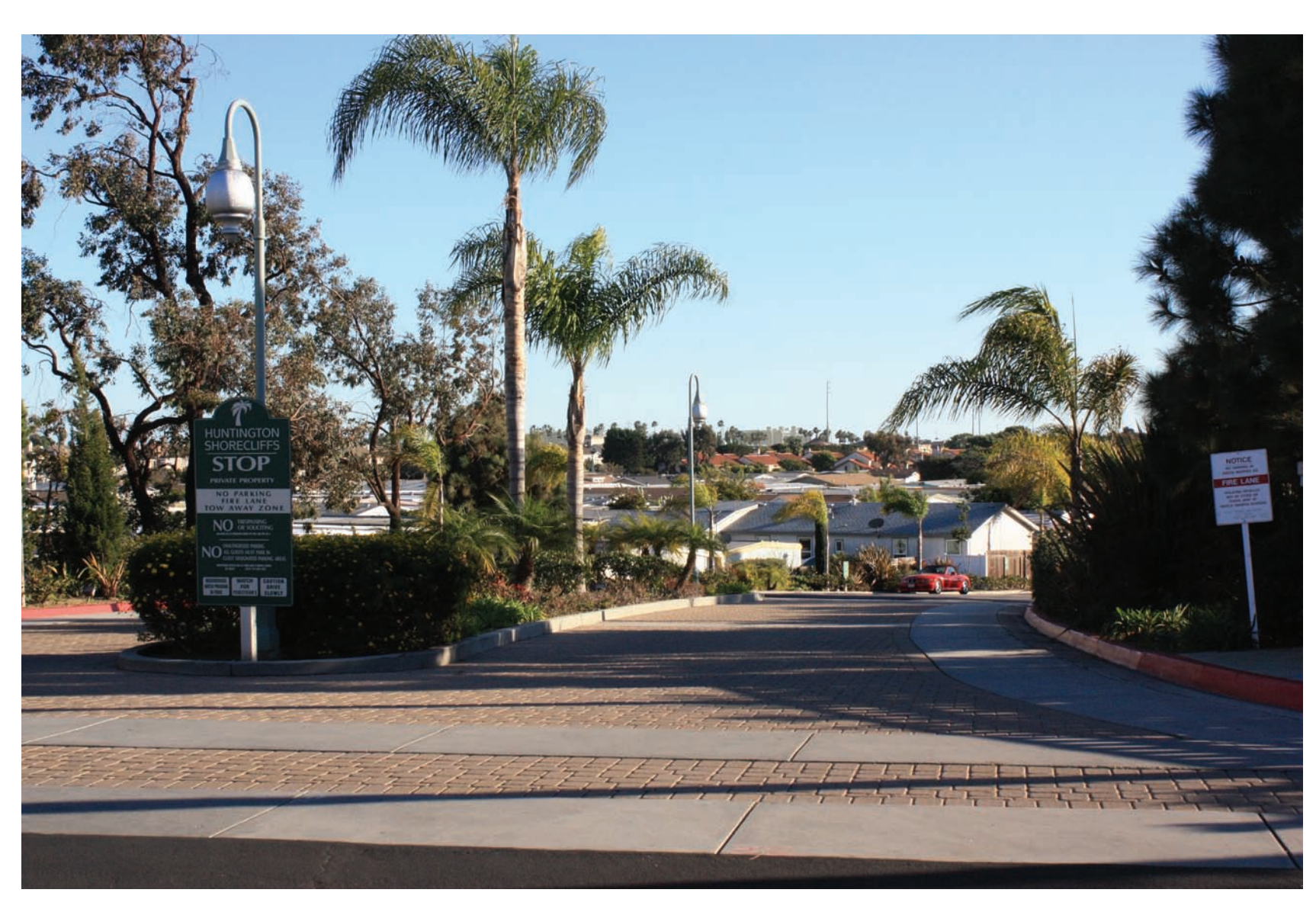
B. Simulated view looking southeast toward project site from Frankfort Avenue at the entrance to the Huntington Shorecliffs residential community that depicts the appearance of the view after completion of the project.