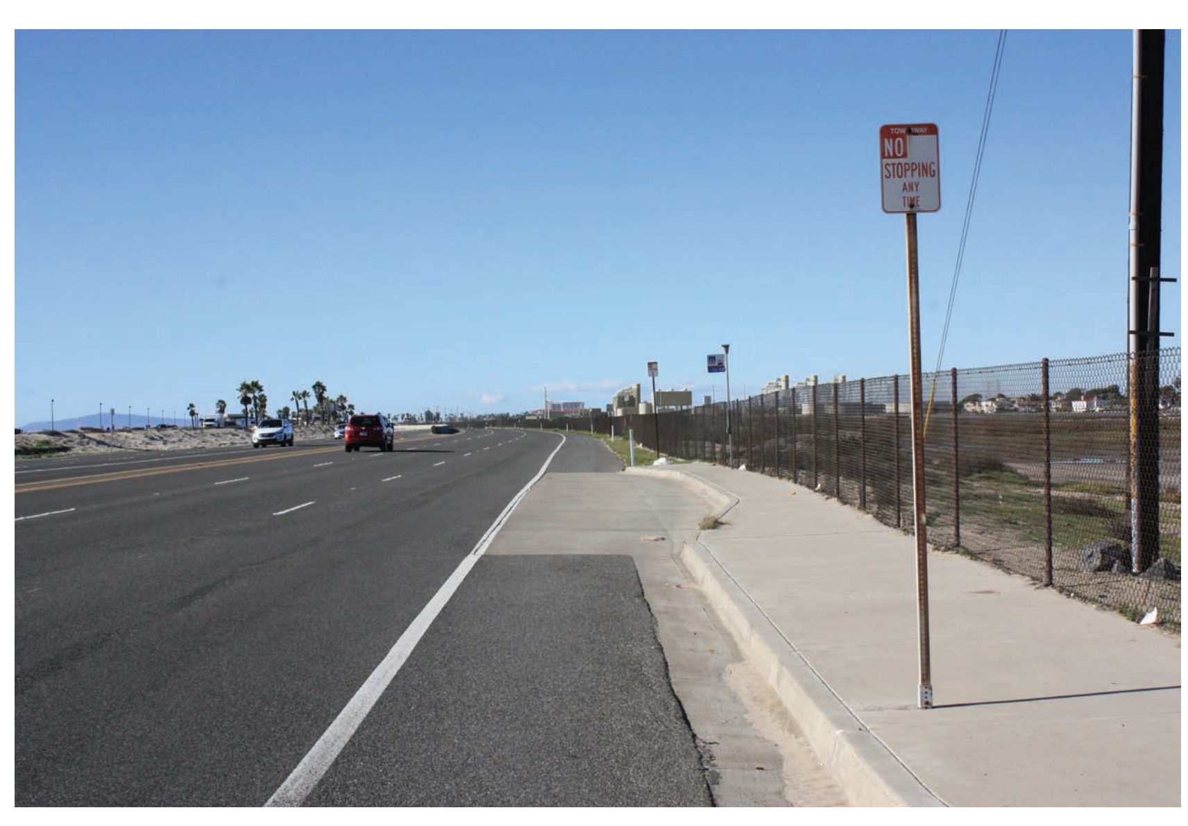
B. Simulated view looking northwest along Pacific Coast Highway at Brookhurst Street that depicts the appearance of the view after completion of the project.