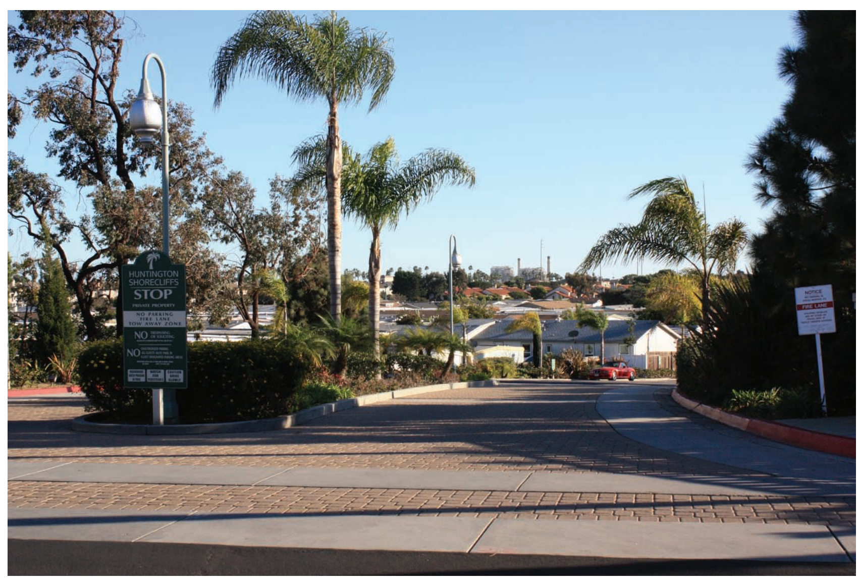
A. Existing view looking southeast toward the project site from Frankfort Avenue at the entrance to the Huntington Shorecliffs residential community.