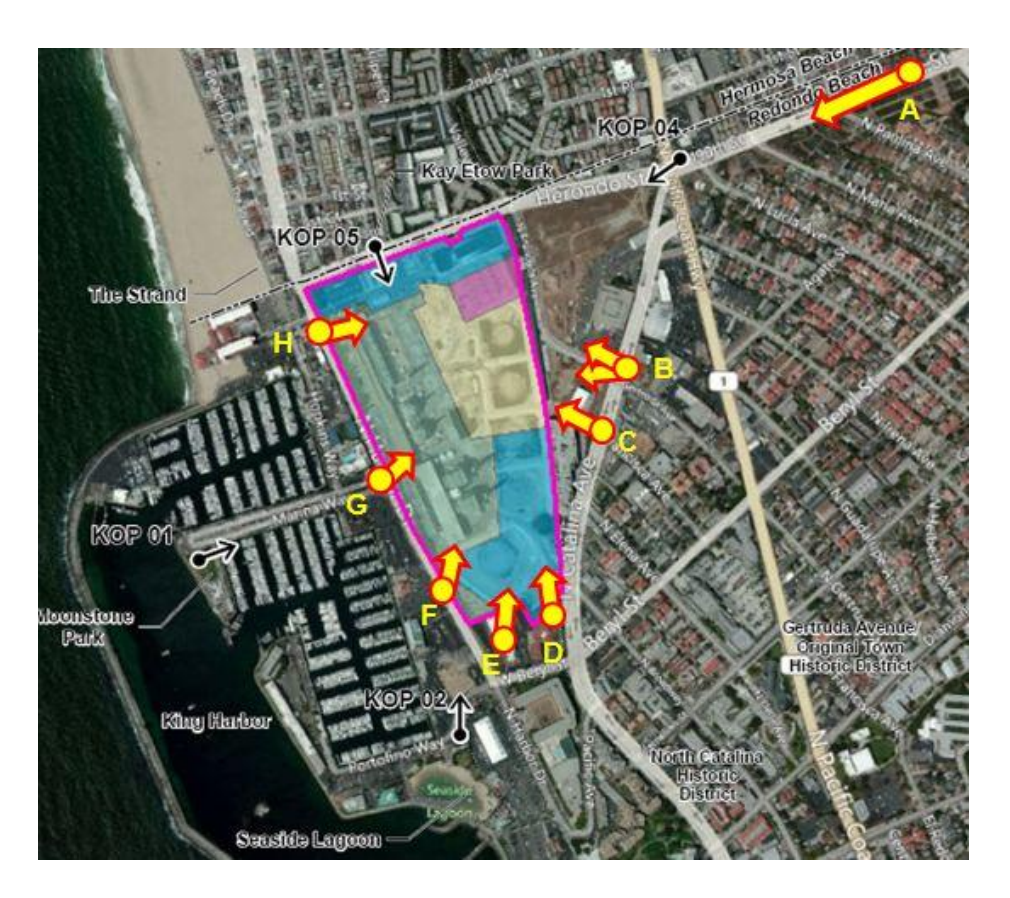
Figure 7: AES avoided the most impactful and frequent points of view shown in yellow.

But more important than the "convenient" perspectives chosen by AES, the assessment avoids more impacted views that would be viewed by far more people far more frequently. Figure 7 shows the KOP's used by AES in their submission and those that are more representative of the real impacts of the plant on views.