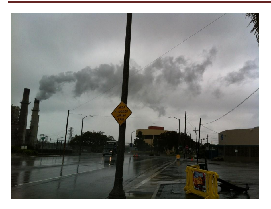
Photo 1-AES Redondo emissions being blown directly into neighborhood