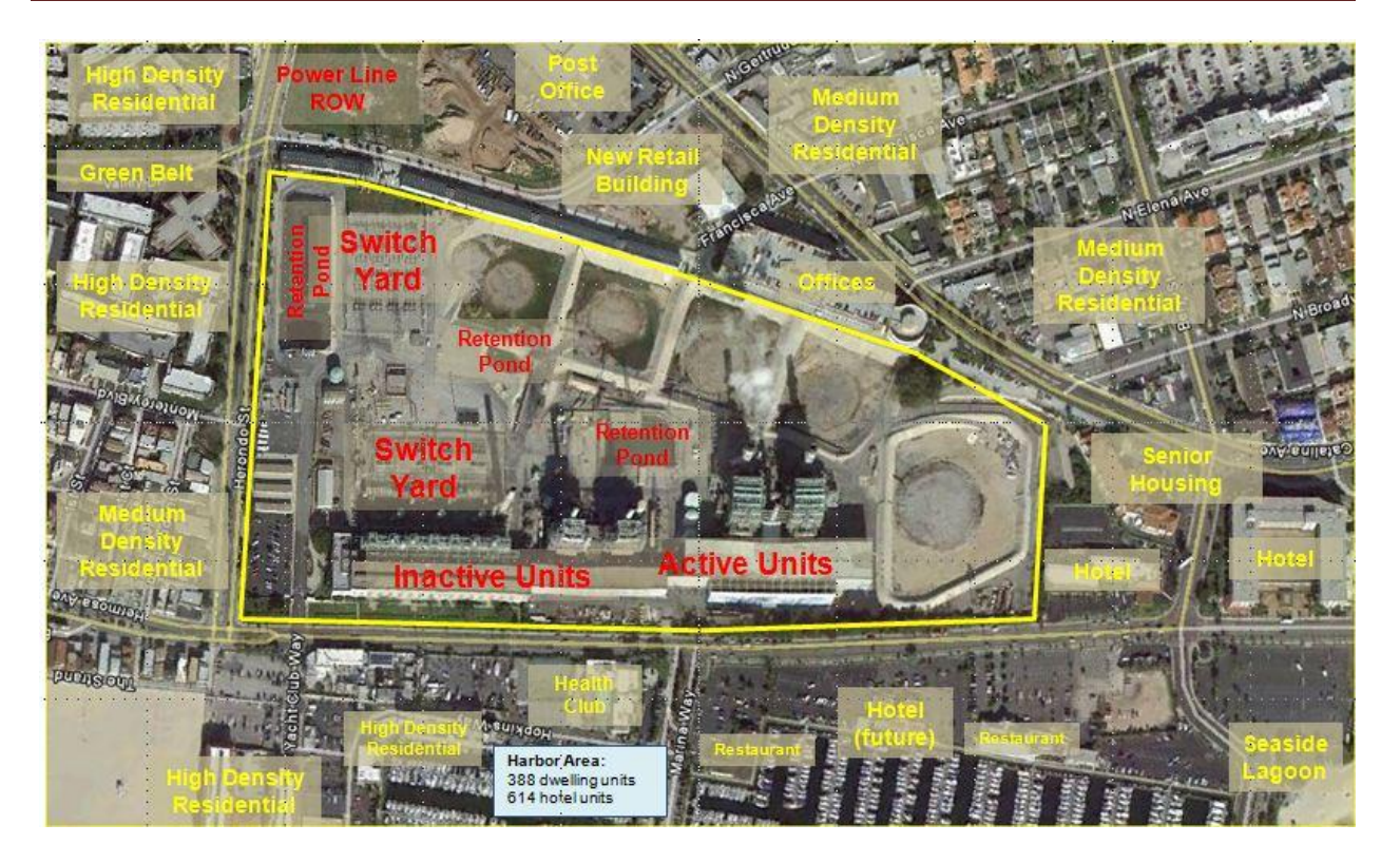
Figure 1: The AES site is closely surrounded on all sides by incompatible uses. This is no place for a power plant.

To the north is high density residential development in Hermosa Beach. Hermosa' population density is over 13,000 people per square mile making it one of the most densely populated Cities on the California Coast.