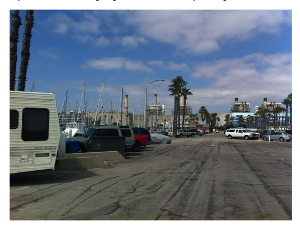
Figure 6: Masking impact of trees disappears 50 yards to the north of AES perspective

These view perspectives are not representative of how most of the public view the power plant site. But even within these perspectives, AES carefully chose perspectives that artificially