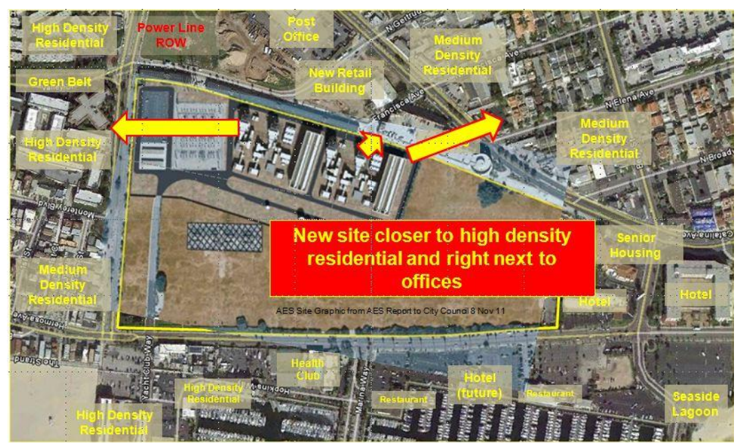
Figure 3: Proposed AES location is closer to residential neighborhoods and offices

Figure 4 shows the broader perspective of the incompatibility of a new power plant with surrounding uses. Approximately 26,000 people live within 6000 feet of the plant. This is a densely populated area surrounded by schools and highly used recreational resources on all sides. The power plant is especially incompatible with these uses.