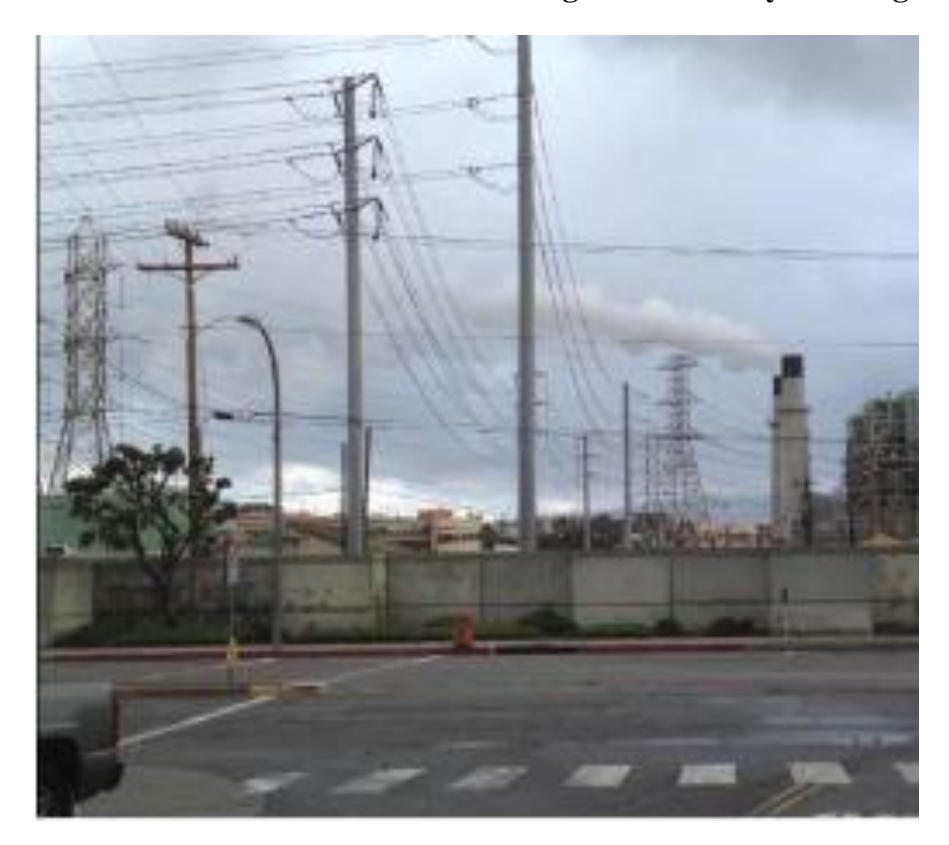
Photo 2: AES Redondo emissions being blown directly into neighborhoods.