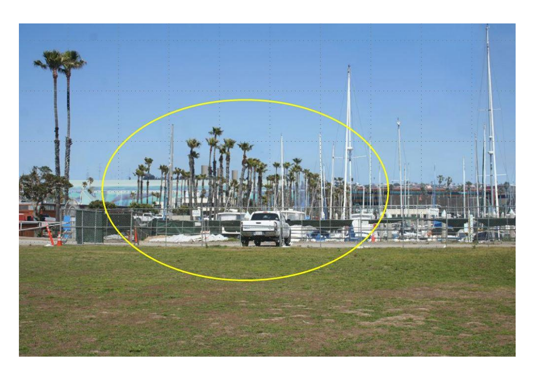
Figure 5: AES chosen perspective "conveniently" uses palm trees to obscure new plant site