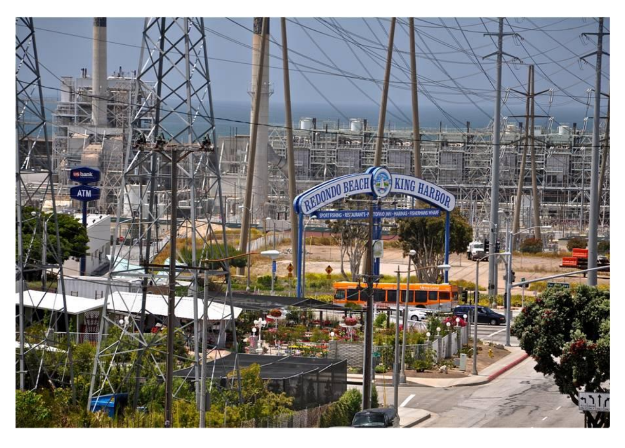
Figure 8, AES neglects showing the view impact of the new plant from this heavily traveled gateway to Redondo Beach, 190<sup>th</sup> Street

Figure 8 demonstrates the view from recommended view point A. This perspective is experienced by Redondo visitors coming from inland using South Redondo's most heavily used East West arterial, 190<sup>th</sup> Street. Similar views are experienced by residents in neighborhoods uphill from the plant.