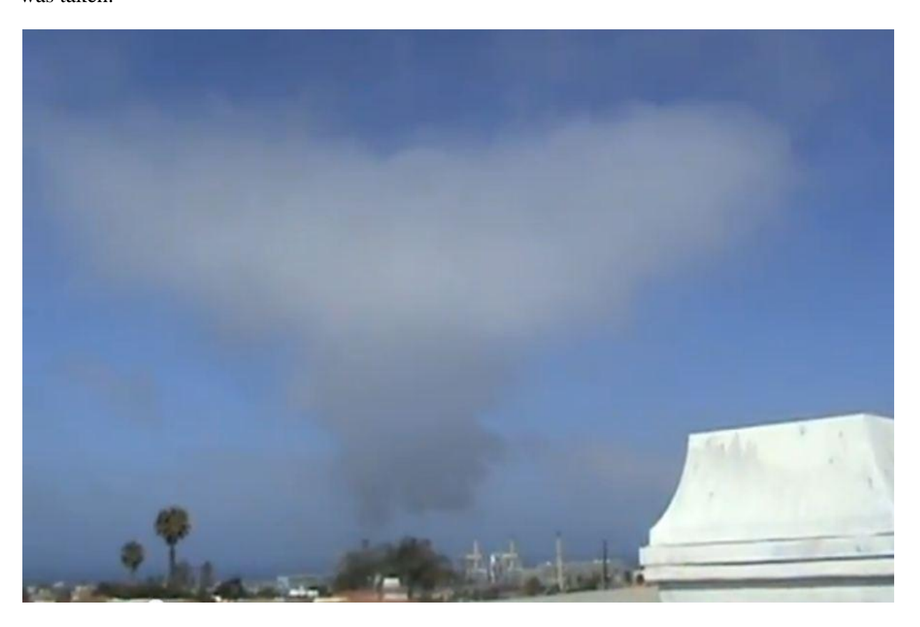
Photo 3: Screen capture from resident video shows emissions from AES Redondo being blown directly at resident on rooftop deck under light wind conditions

this video, under normal light wind atmospheric conditions residential neighborhoods uphill of the power plant are being directly exposed to the plume, without time for the plume to disperse to any great extent. There is an elementary school in the same neighborhood where this video was taken.