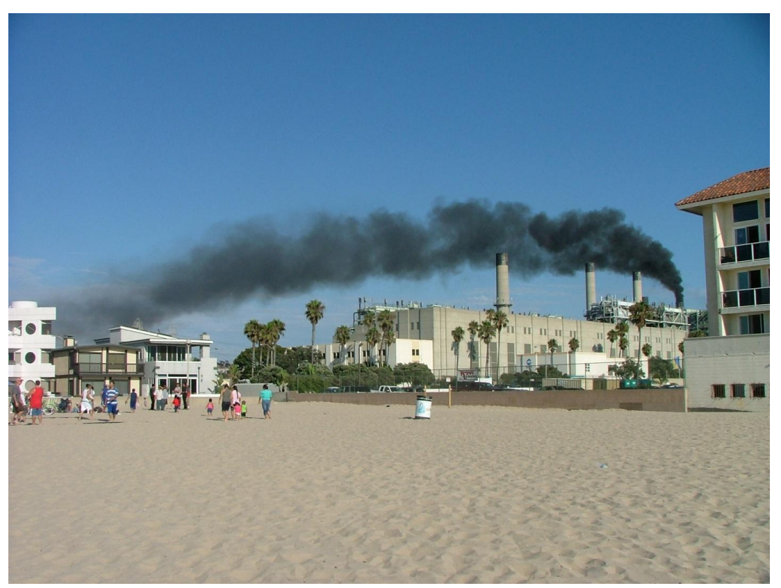
Photo 3: AES plant upset condition shows emissions blowing down into residential area

Photo 3 shows power plant emissions during an upset condition. Here we see under relatively light afternoon winds, the emissions are blowing down into residential neighborhoods to the northeast of the plant and the lack of dispersion before impacting the neighborhood.