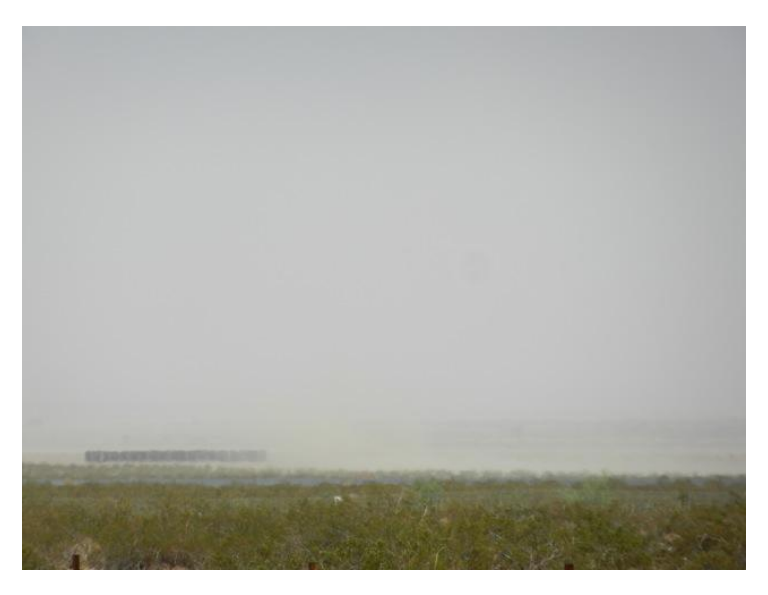
Desert Sunlight Project near Desert Center, California. These dust storms were reported to be rare before the construction of the project began.