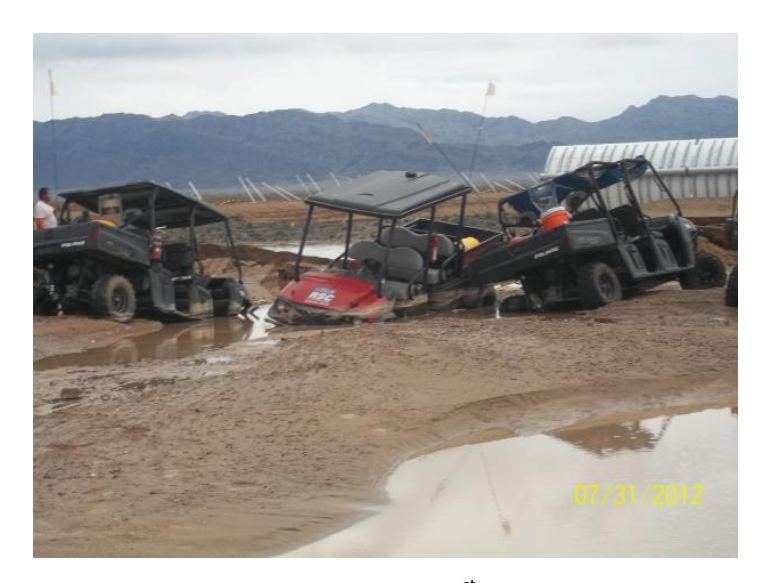
^Genesis Solar Project flood, July 31<sup>st</sup>, 2012