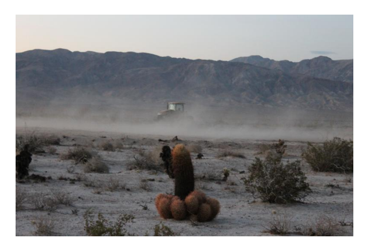
Ocotillo Wind Express Project, May 2012

The following three photos show that there is a consistent failure of large solar and wind project developers to control and mitigate the dust emissions that have resulted from the large disturbances caused by recently approved high profile renewable energy projects. In spite of the fact that all of these developers have promised that dust emissions would not be an issue, we are finding that they are falling short of their mitigation requirements.