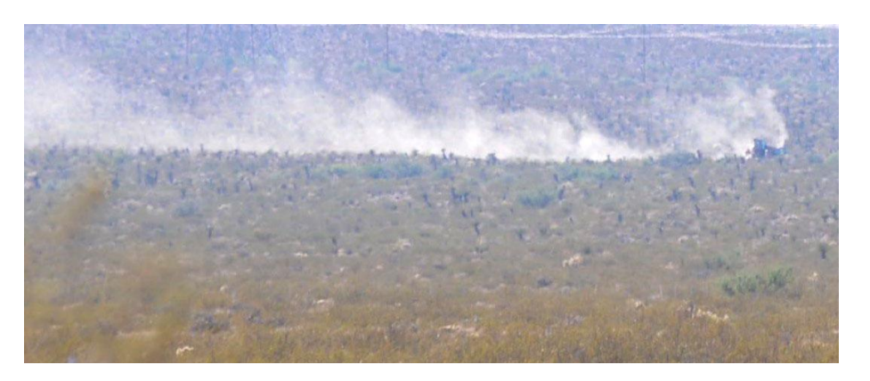
Ivanpah Solar Electric Generating System, October, 2010

Mitigation of Fugitive Dust Using Polymers: Most solar and wind projects are using water, but since that is having questionable success, many developers are looking to use synthetic and organic polymers. The use of these products in single applications can fall within acceptable limits for their use, however continued use within the same area and the build up over time has not been studied and therefore no restrictions have been made for any product.