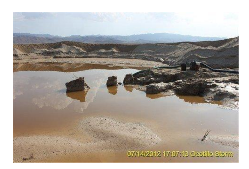
^Flooded wind turbine construction site; Ocotillo Wind Express project Site, June 2011