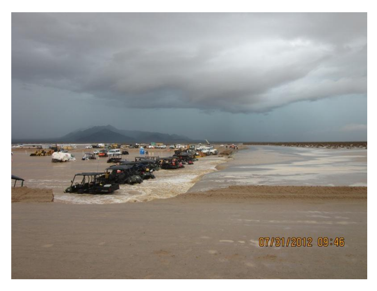
^The biggest flood took place at NextEra's Genesis Project on July 31<sup>st</sup>, 2012. The close proximity to a dry lake and alluvial fans make this project location one of the poorest choices to site a large solar project.