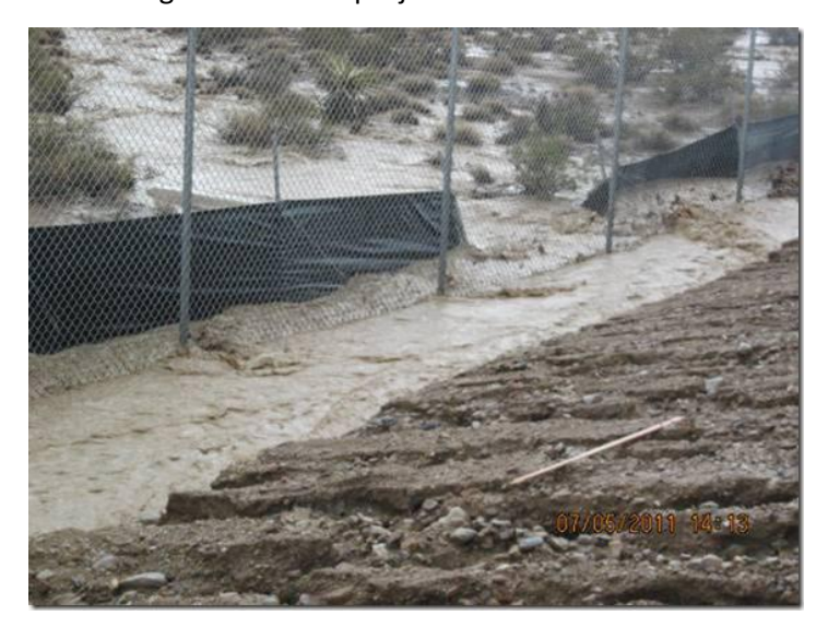
^Ivanpah Solar Electric Generating System: desert tortoise exclusion fence removed by floods. July, 2011

These three projects received significant flood damage in less than one year under construction. It makes us wonder how wise it really is to build a project in an unstable alluvial flood zone when the goal is for that project to last three decades.