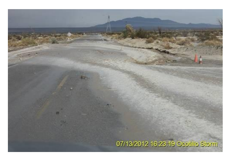
Unknown leftover foam from a chemical dust suppressant was spread everywhere when the Ocotillo Wind Express project site flooded in June, 2012