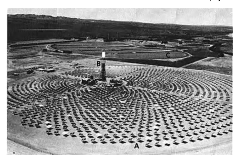
FIGURE 1. Aerial view of Solar One: (A) heliostat field, (B) central receiver tower, (C) evaporation ponds. Tower height = 86 m, diameter of field = 765 m.

To determine the impact of bird mortality on local populations, 1–2 observers conducted surveys of relative avian abundance within an area of approximately 150 ha surrounding Solar One, concentrating on the facility grounds (32 ha), evaporation ponds, and agricultural fields. These surveys were conducted on at least 2 d per visit for 3–4 h/d.