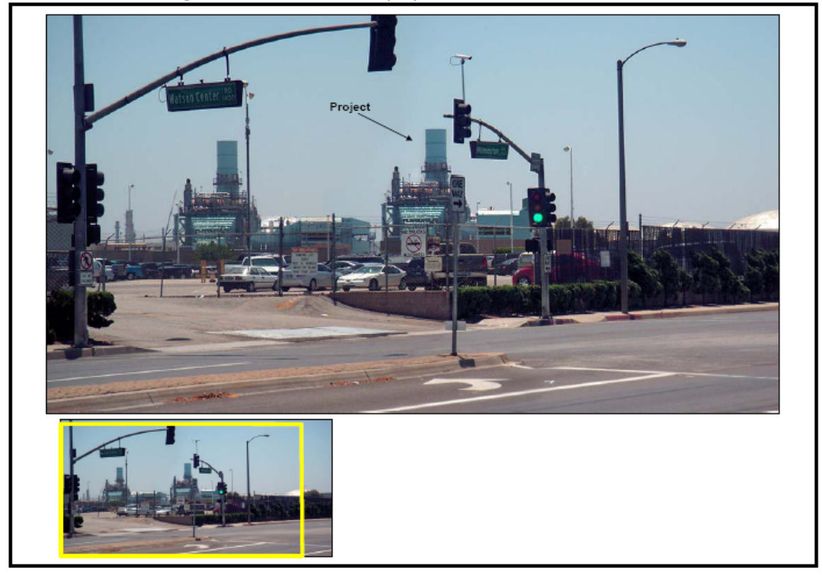
(Ex. 1, Fig. 5.13-8)

Watson Cogeneration Steam and Electric Reliability Project - KOP 1: Simulated View of BP Watson from KOP 1