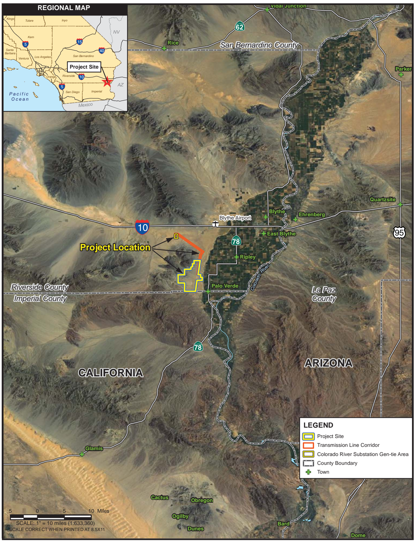
CALIFORNIA ENERGY COMMISSION - SITING, TRANSMISSION AND ENVIRONMENTAL PROTECTION DIVISION