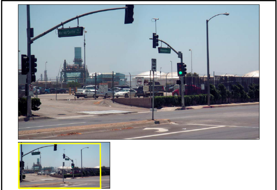
(Ex. 1, Fig. 5.13-7.)

Watson Cogeneration Steam and Electric Reliability Project - KOP1: Existing View of BP Watson from KOP 1