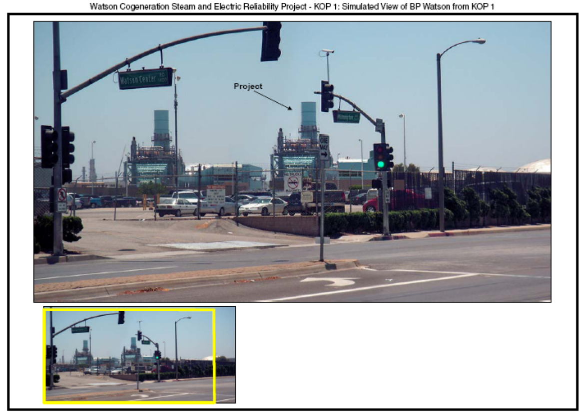
(Ex. 1, Fig. 5.13-8)

The only portion of the Watson Project that would be readily visible to the public would be the new HRSG and exhaust stack from the KOP 1 viewshed. While the stack would add another heavy industrial character feature to an area that is already heavily industrialized, the scale, form and color of the HRSG would not dominate the view nor would it block or disrupt any scenic views or vista. (Ex. 200, p. 4.12-16.) There would be no substantial change in visual quality since the limited visibility of the project would not result in substantial alteration of the composition, vividness, unity, or intactness of the existing landscape setting. We therefore find that the introduction of project structures would not substantially degrade the existing viewshed of KOP 1. However, to ensure that the project's appearance is consistent with the existing structures, Condition of Certification VIS-3 would require appropriate treatment of the surfaces of all project structures.