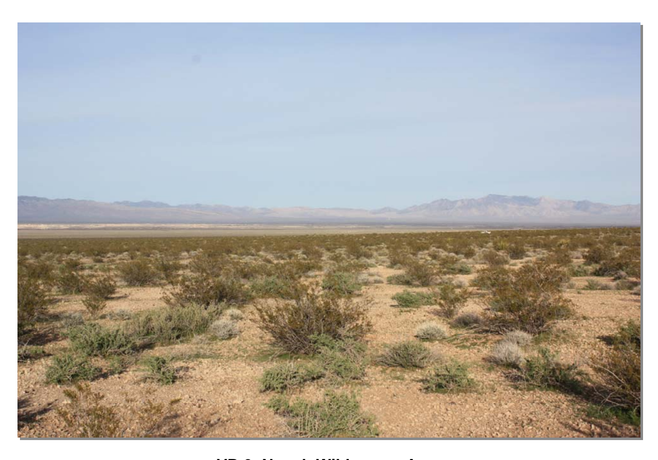
VP-6: Nopah Wilderness Area View east toward the Hidden Hills Solar Electric Generating System Proposed Project Site