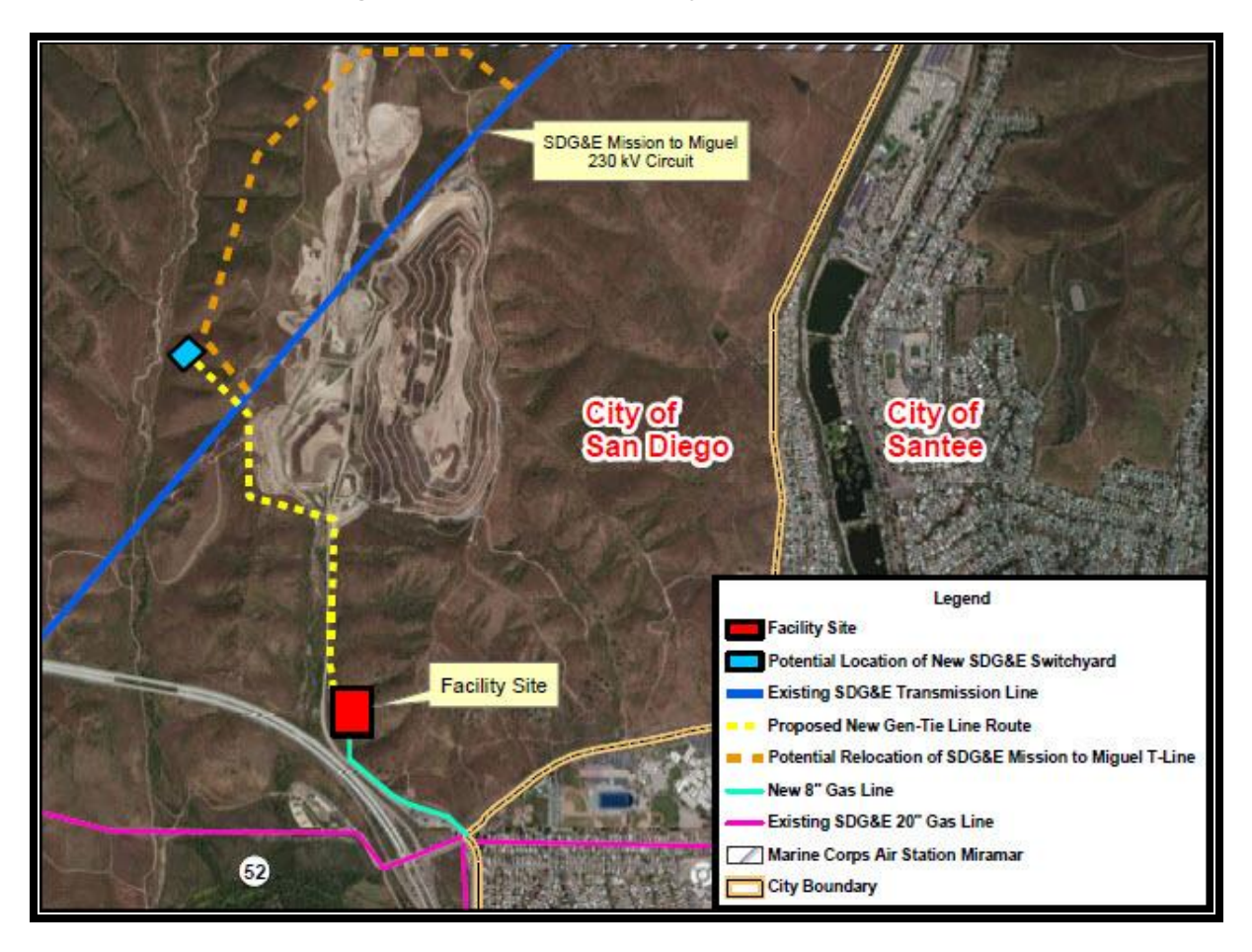
Figure 2.1: Map of the Project Location