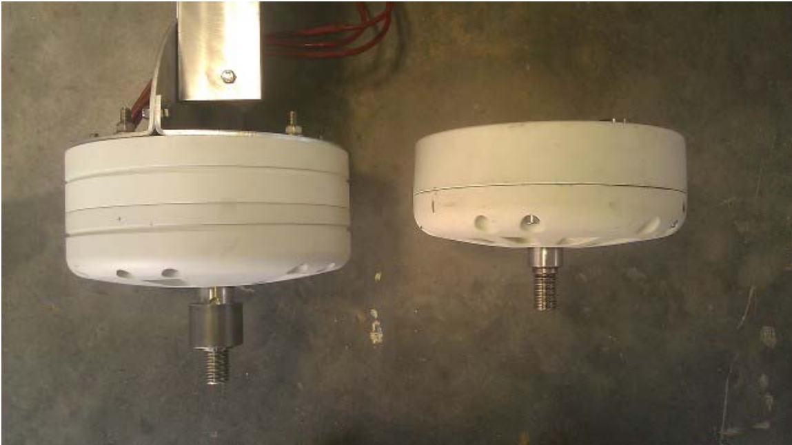
DyoCore PMA right.

Please note the very clear size difference from larger lamination stack, windings, and magnetic armature. It is clear to see that one could produce more energy than the other.