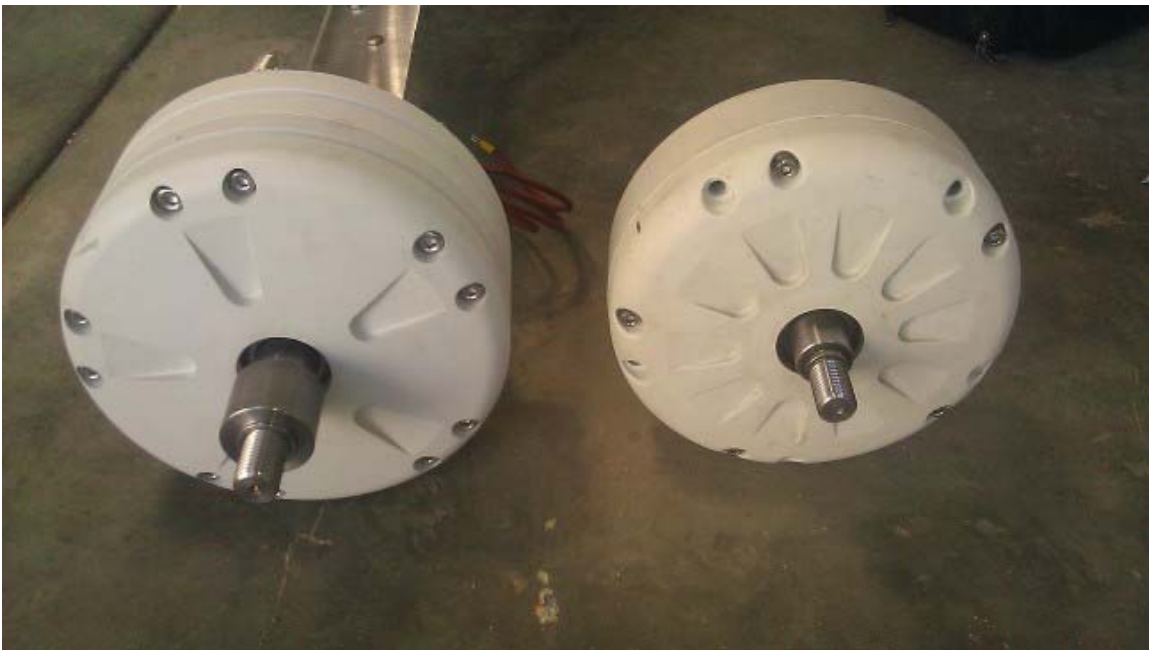
Front high view of both PMA's side by side TLG-1800-GT left / left DyoCore right.

I hope this clarifies that TLG did not use the DyoCore PMA for our rating.