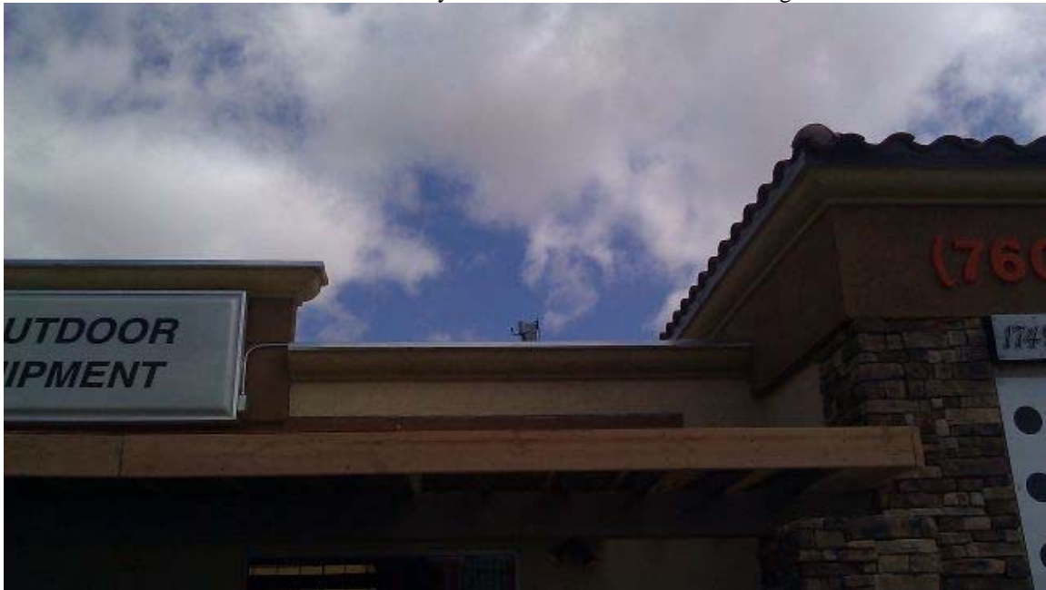
Photo 1 Broken DyoCore turbine mounted on building

My opinion of the DyoCore yaw assembly having lack of engineering and perhaps all units will break if subjected to high wind conditions.