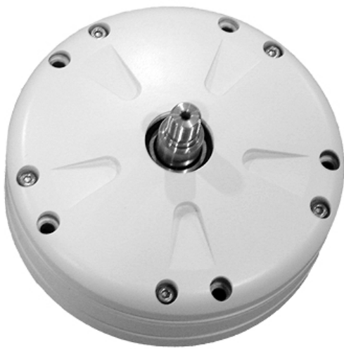
GL-PMG from Ginlong (front view)

Please note 5 distinctive notches in face