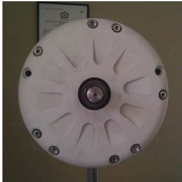
PMA by DyoCore (front view)

Please note 10 distinctive notches in face