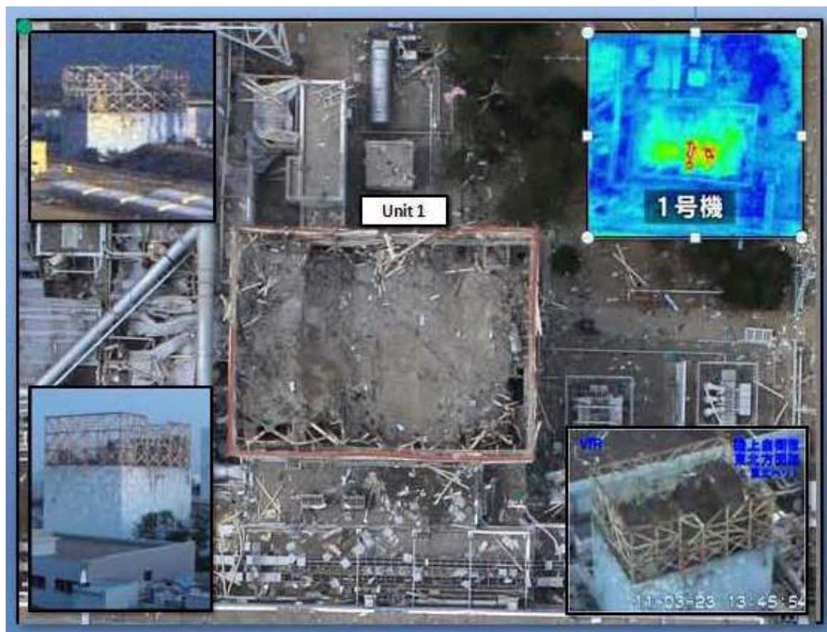
Figure 3: Damage to Unit 1