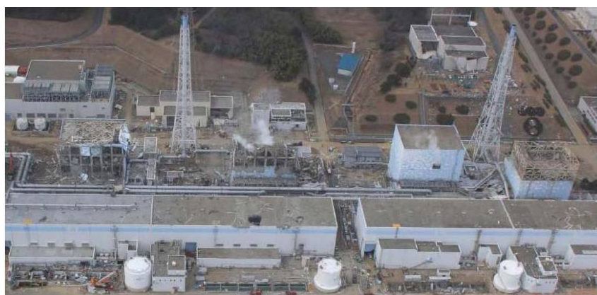
Figure 7: Fukushima Dai-ichi Units 1–4 following explosions

As directed in the Chairman’s tasking memorandum, the Task Force emphasizes the need for the staff to maintain awareness and develop further insights during the long-term followup of the Fukushima event. Additional information is expected to evolve and become better understood regarding (1) the condition of structures, systems, and components (SSCs) in Units 1 through 6, including the effects of the seismic and flooding events and the explosions, (2) the timing and success of the actions taken by facility staff, including the adequacy of procedures and SAMGs, and (3) the progression of the accidents in the Unit 1, 2, and 3 reactors and the Unit 1, 2, 3, and 4 spent fuel pools.