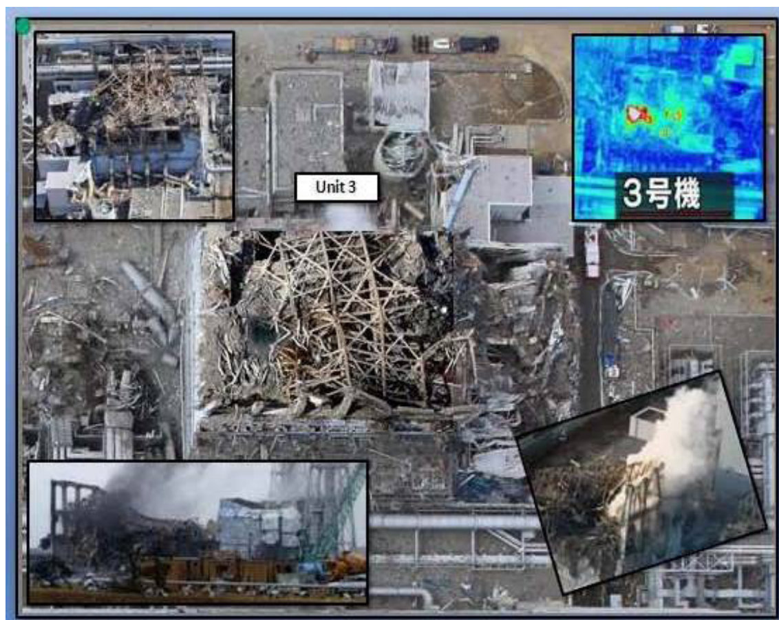
Figure 5: Damage to Unit 3