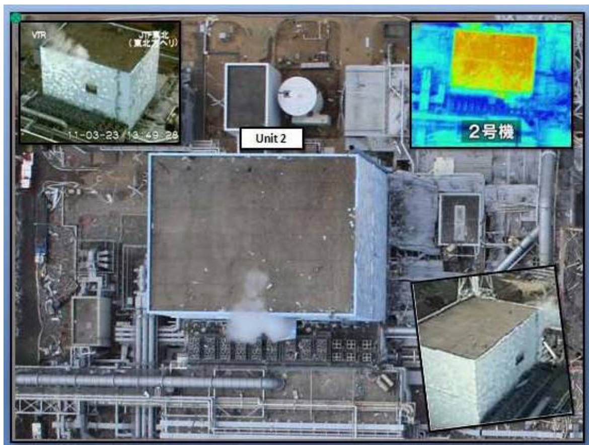
Figure 4: Damage to Unit 2

~06:00 Explosion; suppression chamber pressure decreased indicating the possibility that primary containment was damaged