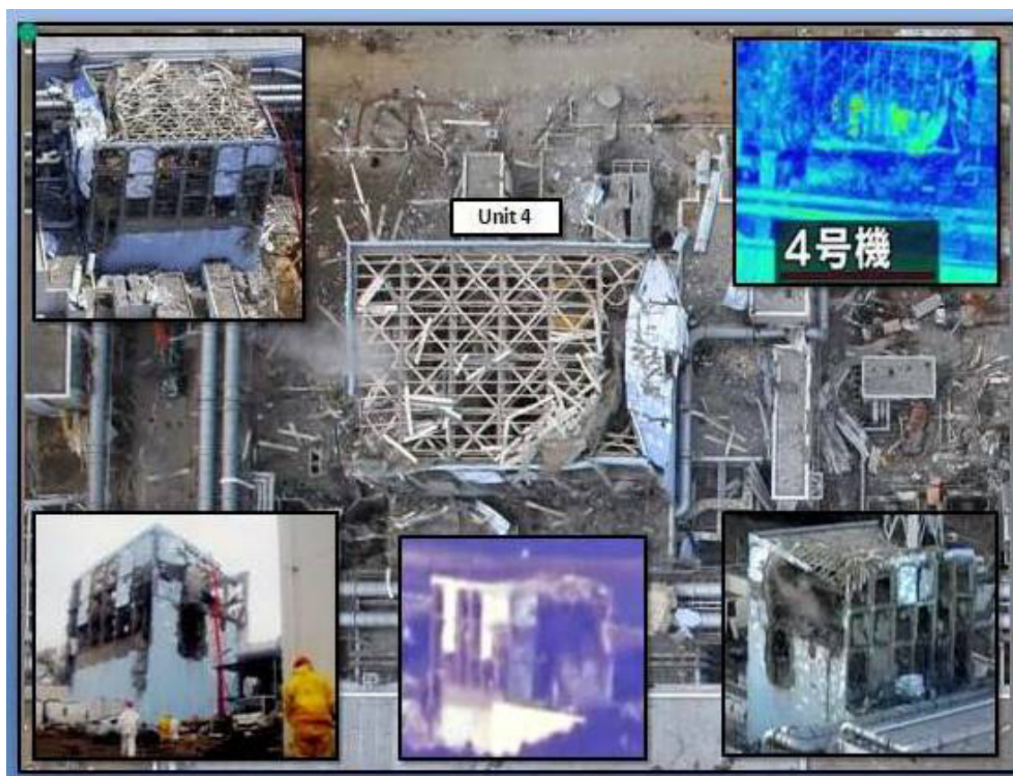
Figure 6: Damage to Unit 4