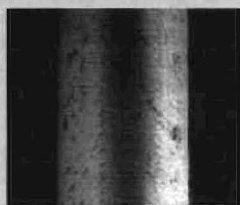
Human Hair (70 \mu m diameter)

The American Lung Association believes that *PM 2.5 [emission from fossil-fuel burning] represents the most serious threat to our health. Its has the ability to penetrate deeper into lung tissue, and eventually the brain and circulatory system. Even a small increase in PM 2.5 can result in a significant increase in mortality.