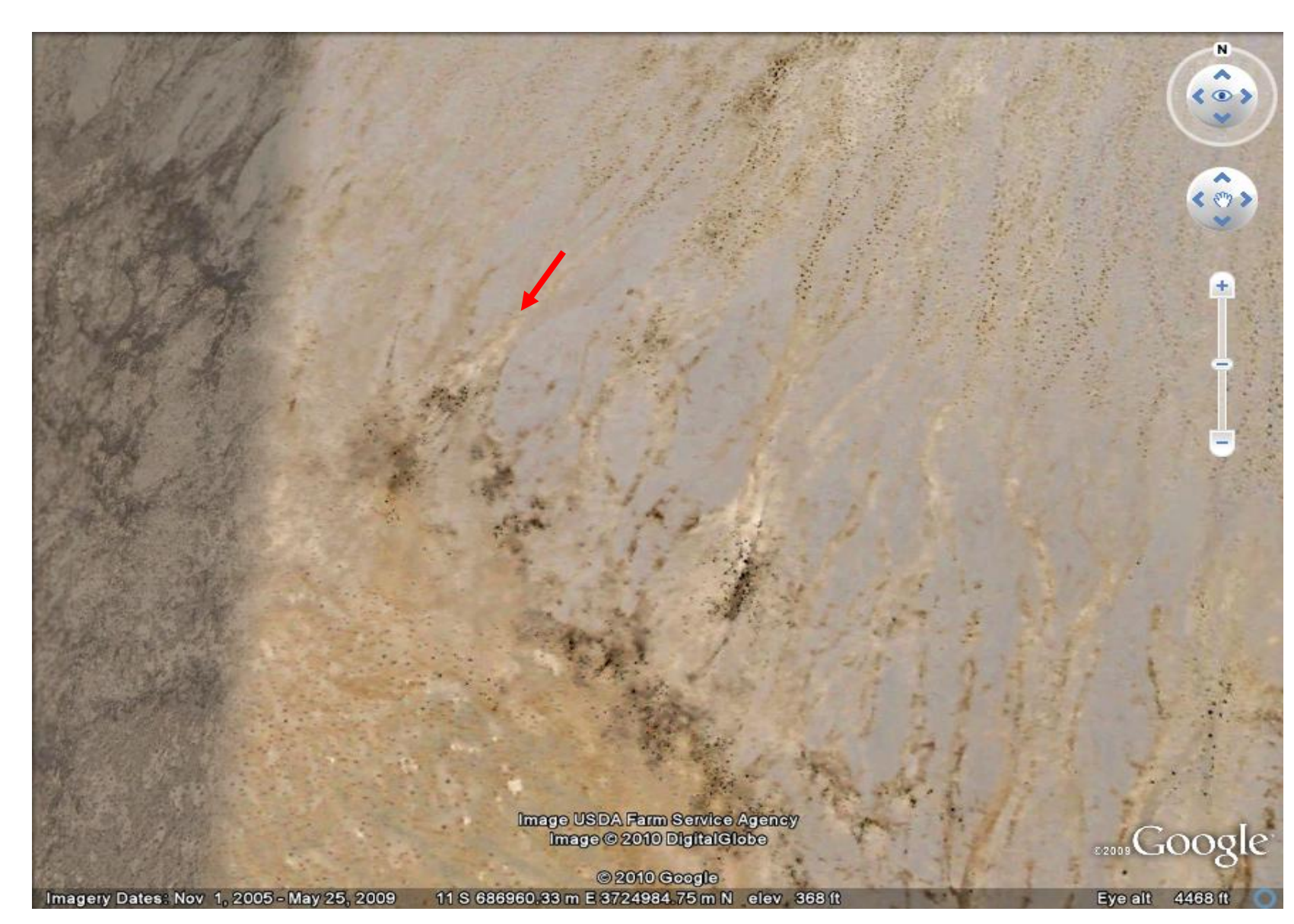
Figure 2. Area under the 151-acre sand shadow. The arrow indicates the wash in which ribbed cryptantha was observed in 2010. Note that there are a few linear patches of sandy habitat associated with drainages interspersed with largely non-sandy habitat.