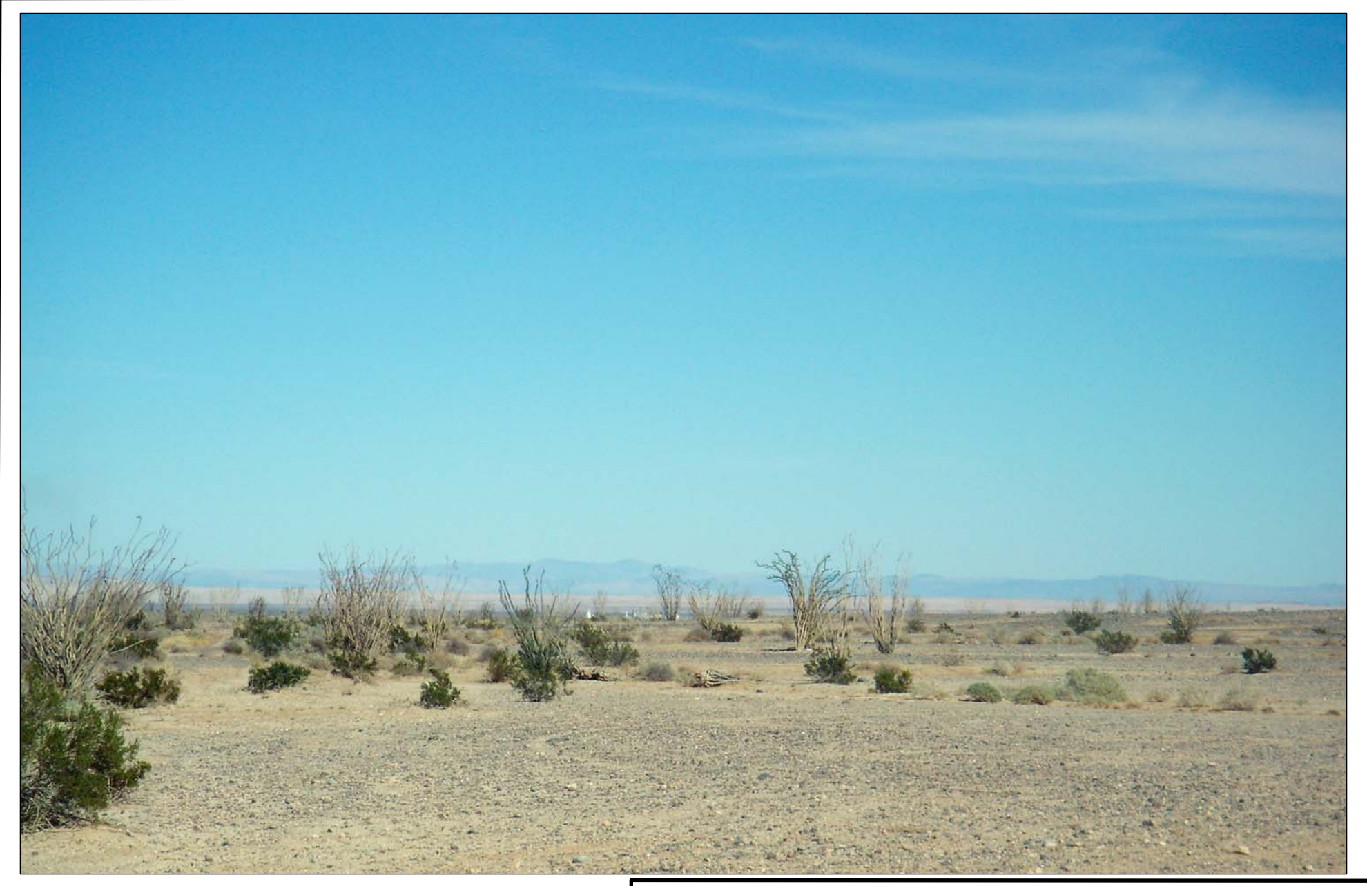
KOP 2: Existing view from Yuha Geoglyph Monument along De Anza Trail (approximately 2.5 miles south of Project).