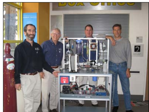
The test station is delivered to UC Berkeley.