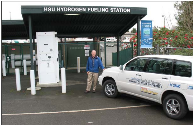
The Toyota Highlander FCHV-adv “advanced” fuel cell vehicle and the HSU hydrogen fueling station

SERC and TSRC are presently collaborating on two related projects. The first, headed by the TSRC, involves testing, gathering operational data, and gauging consumer reaction to state-of-the-art hydrogen fuel cell vehicles and fueling infrastructure. Vehicle OEMs Toyota and Daimler are providing vehicles for this project. TSRC recently furnished SERC with a Toyota Highlander FCHV-adv “advanced” fuel cell vehicle for testing (see below). The Highlander is 700 bar capable and has a 400 mile range when its tanks are full. At SERC, drivers are only able to utilize half of the vehicle's range because the station dispenses at 350 bar.