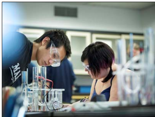
HSU engineering students using the lab kits

The second project, an education project entitled Hydrogen Energy in Engineering Education (H2E3), is headed by SERC and funded by the U.S. Department of Energy (total funding is $524K). It involves developing laboratory hardware and curricula to introduce hydrogen and fuel cell topics to thousands of engineering students in the University of California (UC) and California State University (CSU) systems. During the first year of a three-year project, SERC has delivered fuel cell/electrolyzer laboratory kits and a fuel cell test station to TSRC and the HSU Environmental Resources Engineering Department. We have also begun introducing curricular material in HSU and UC Berkeley engineering courses (see below).