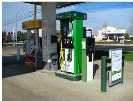
Sacramento – Folsom Blvd