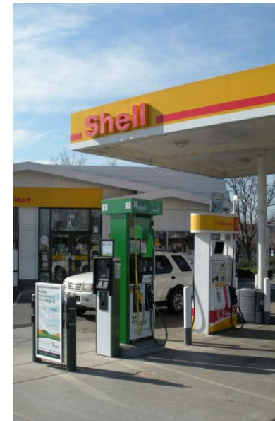
Sacramento - Florin Ave