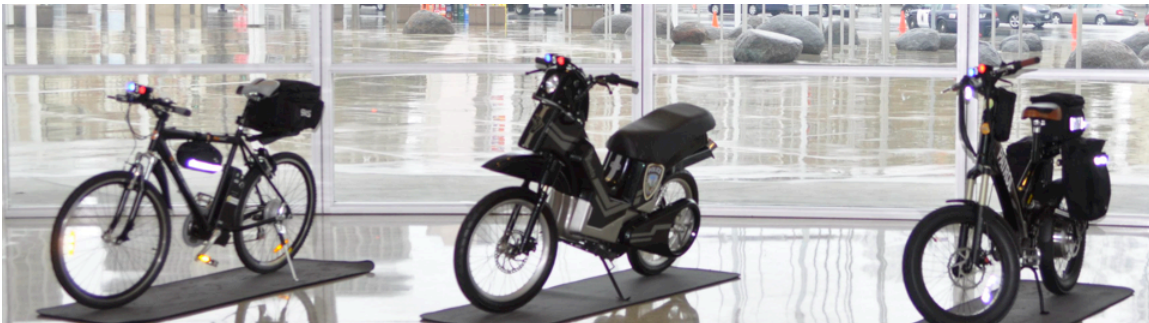
ELECTRIC PATROL VEHICLES

Vehicles: PATROL includes electric “Zero Emission“ Police Bikes, Police Motorcycles, ATV’s, Meter Readers and Small Pickups: