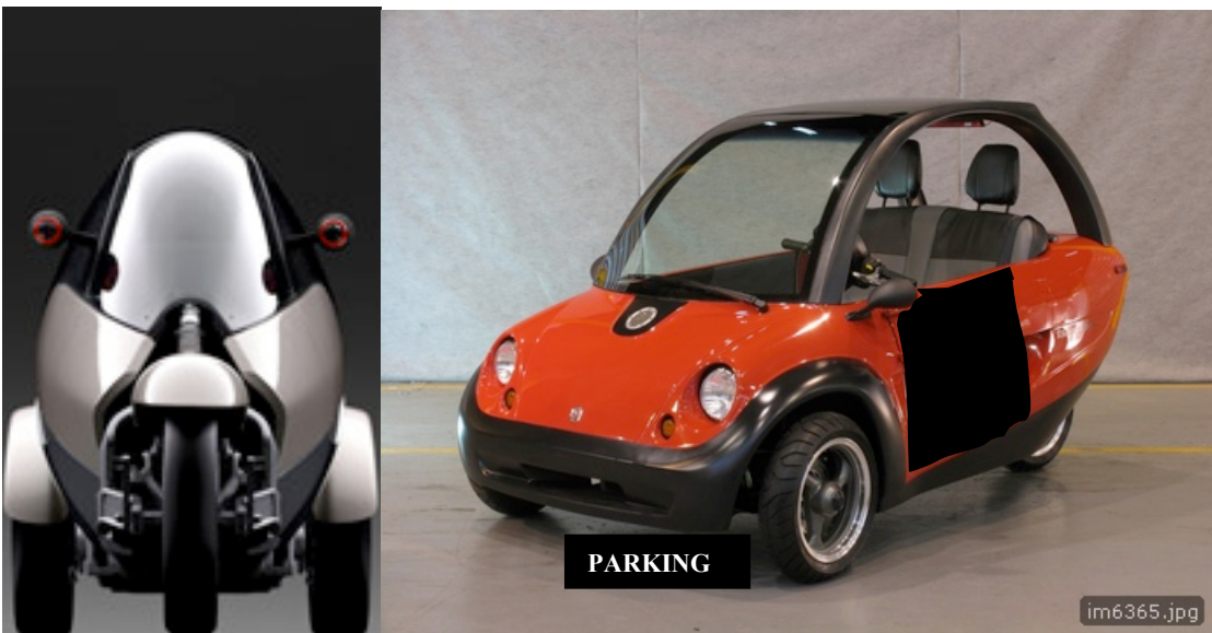
ELECTRIC METER READERS & NEIGHBORHOOD VEHICLES