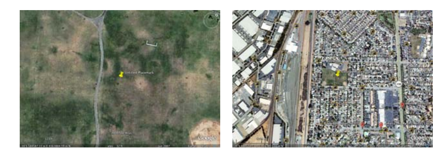
Grass cover measured at fine scale (approximately 95% cover).