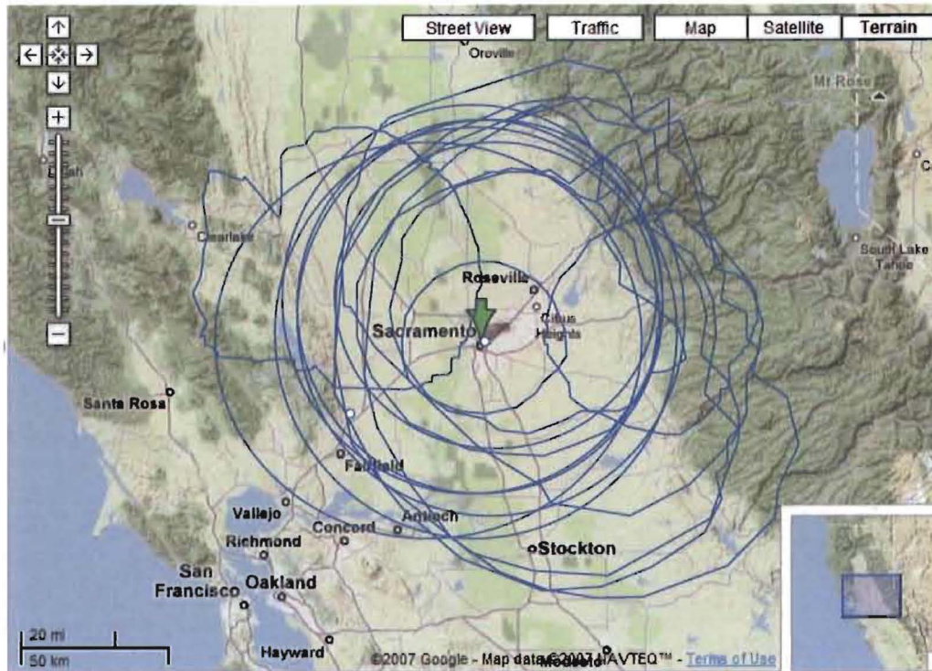
Local Signal Coverage for RDS Stations in Sacramento