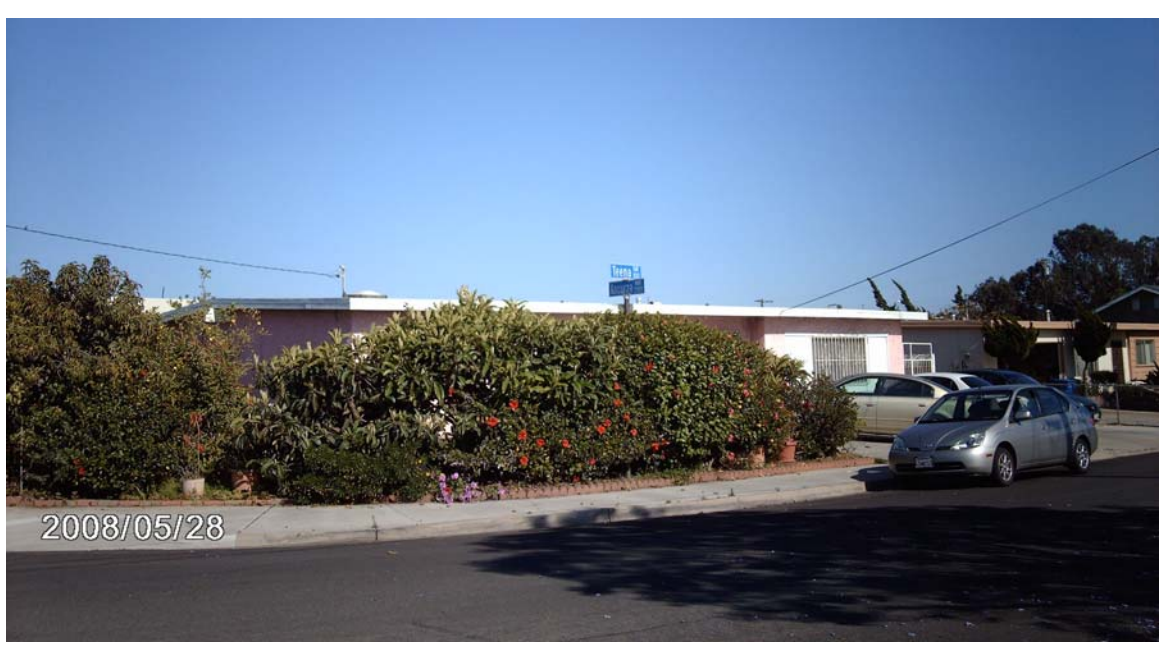
4.12-12 Indeed MMC has been less than honest with more than the excessive height of trees for KOP 3. Most of their pictures have been deliberately taken from behind a large obstruction. This is unrealistic since people would be able see much more of the towers on the other side of the obstruction and to either side.

A tiny bit of the building in the back can be seen above the roof of this home on the corner of Teena and Anzura. Taking the picture directly in front of a tree is extremely misleading. The fact is nearly 40 feet of tower will be visible behind these houses right where the other bit of building is seen in this photo. This will really depress property values and people. This heavy industrial use DOES NOT BELONG this near homes.