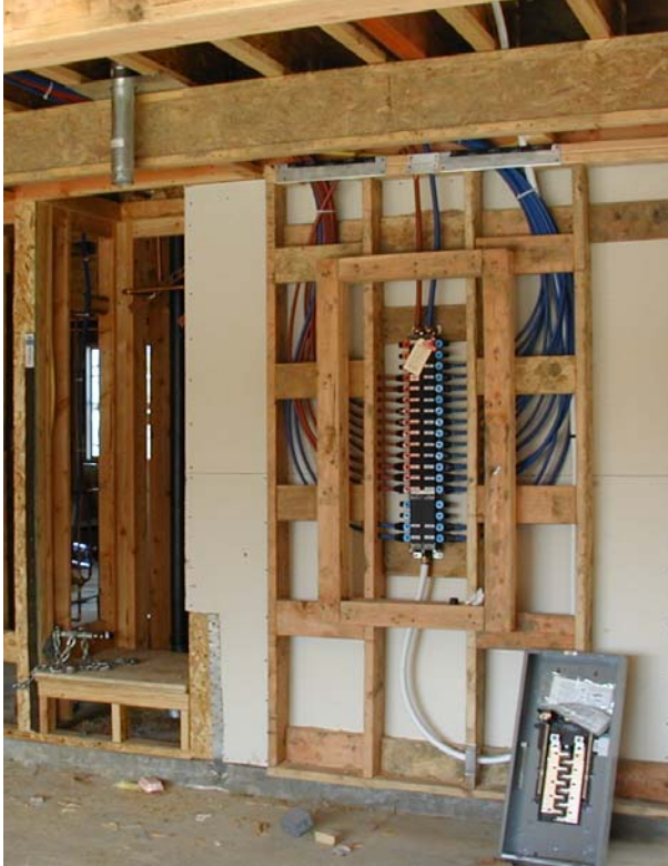
Figure 2: Installed manifold framed out on garage wall with hot (red) and cold (blue) piping