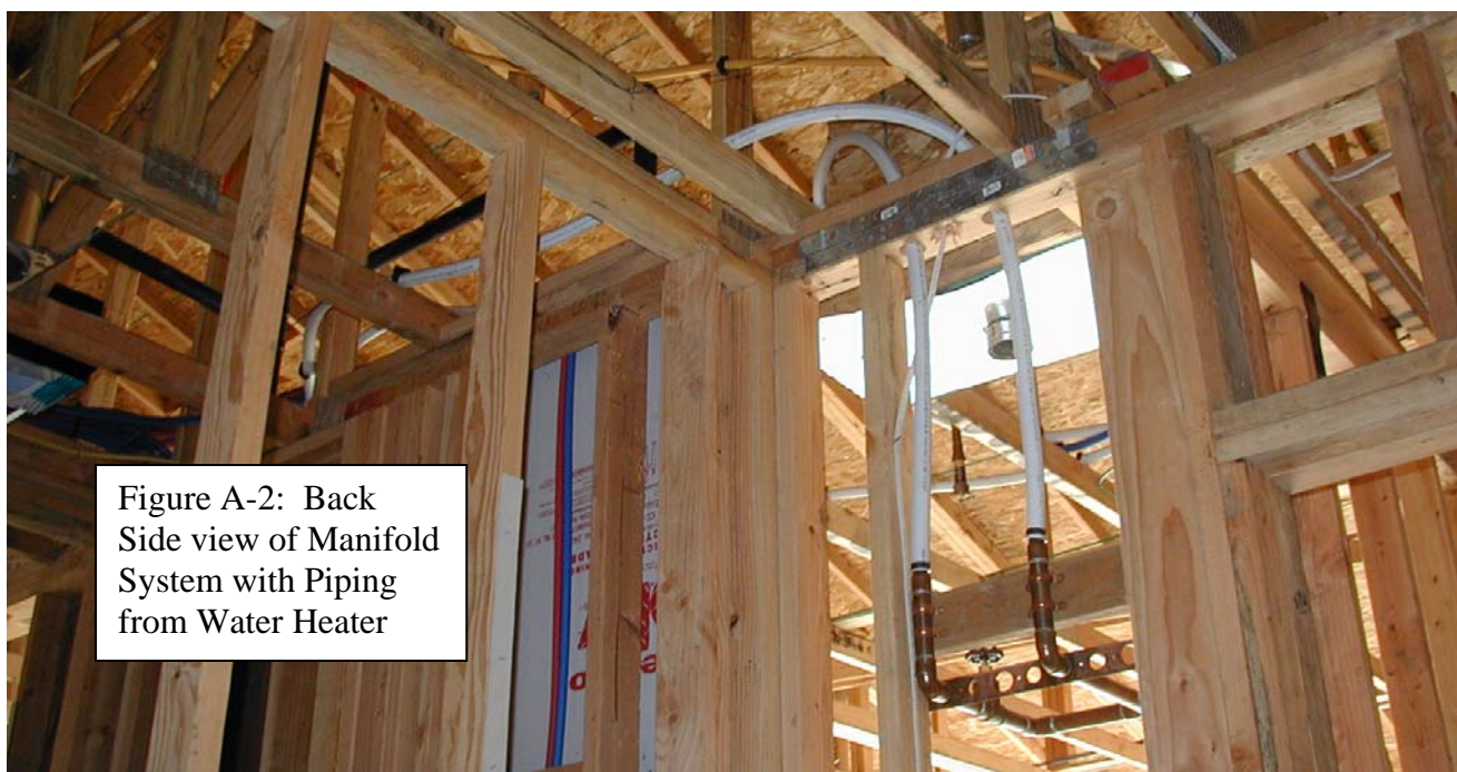
Figure A-2: Back Side view of Manifold System with Piping from Water Heater