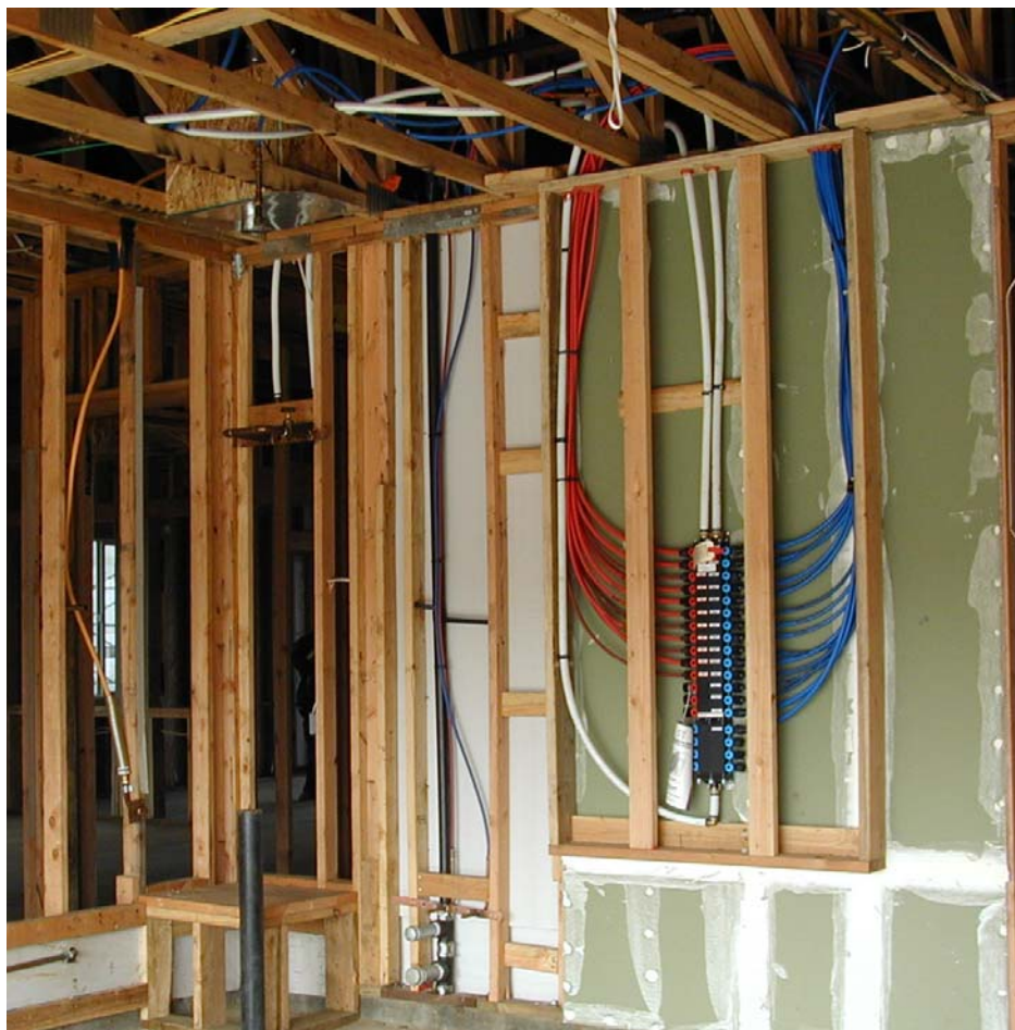
Figure A-1: Installed Manifold System