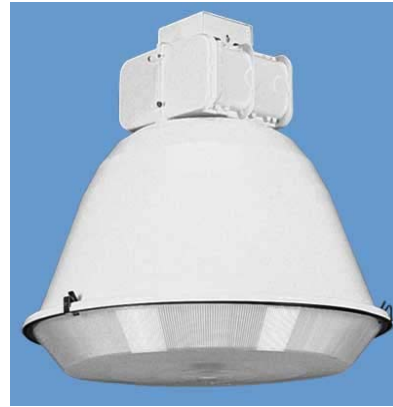
Low-bay: Enclosed die-cast aluminum