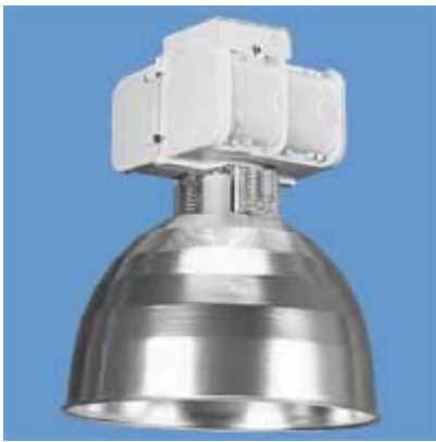
High-bay: Open die-cast aluminum