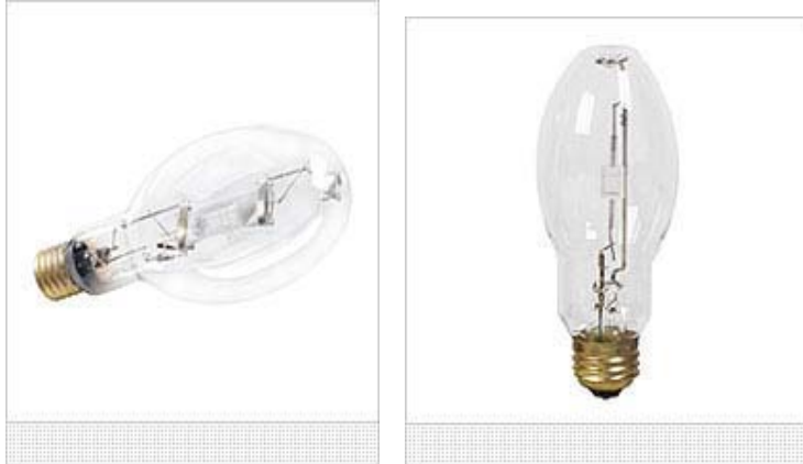
Pulse-start MH lamp