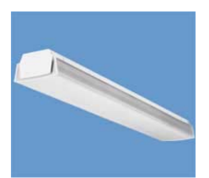
c) 1-Lamp Surface-Suspended wrap-around