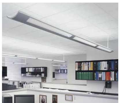
d) Direct/Indirect Fixture (<u>www.finelite.com</u>)