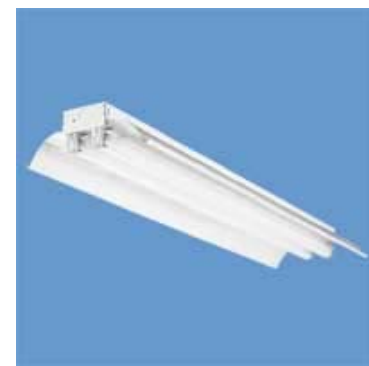
f) Standard industrial two-lamp fixture

Figure 1.Com mon Fixture Types Source unless noted: Lithonia Lighting (www.lithonia.com)