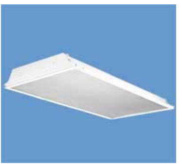
a) two-lamp Lensed Recessed Troffer