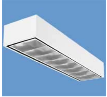
b) 1-Lamp louvered surface-mount