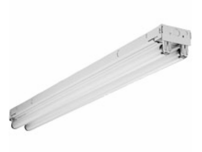
e) two-lamp striplight