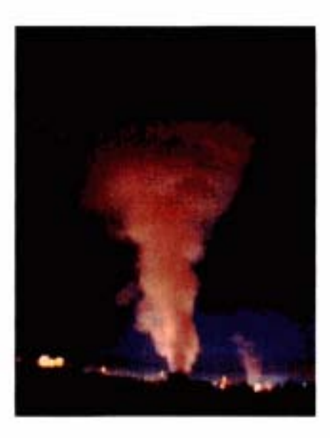
Figures 3 & 4

Absence of any guidance in California and the PEC project to assess whether vertical plumes are likely to have adverse implications from the gas-fired power station fails to point out the fact that very buoyant plumes can readily interact with the overlying inversion and give rise to other problems that may require addressing in environmental impact assessments. This would also include industrial flares or intended releases from pressurized pipelines that occur at this facility on a regular basis that can create significant risk to the nearby community especially dealing with air traffic.