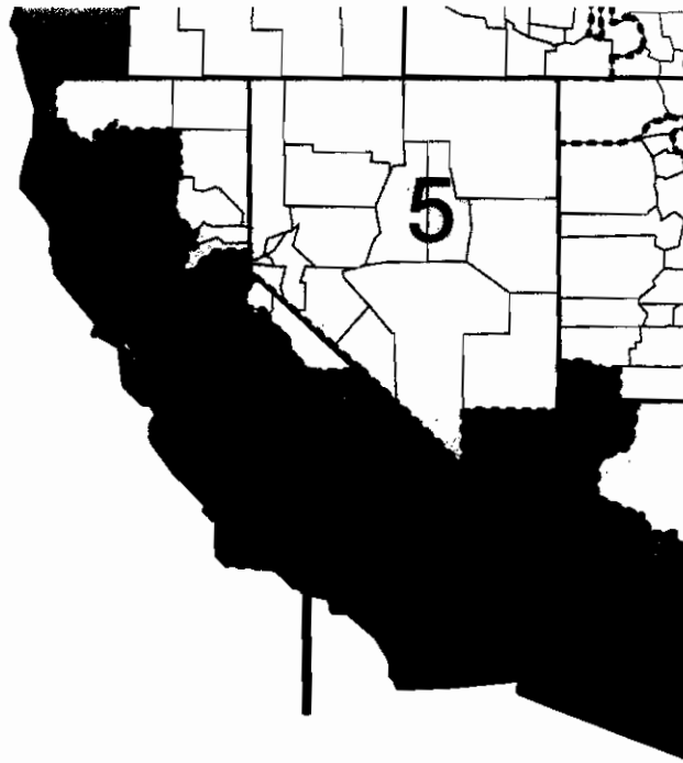
Figure 1 – ASHRAE Climate Zones for California