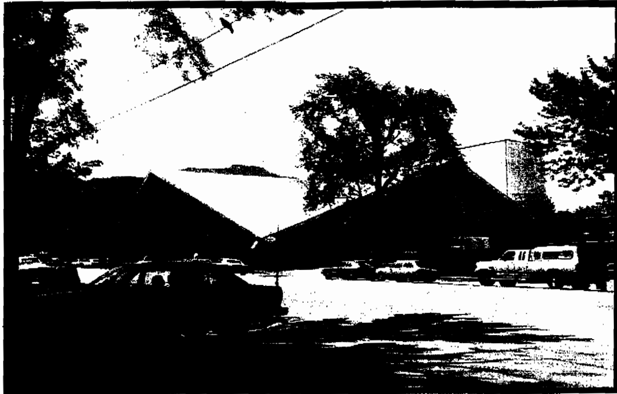
THE BROADMORE CONVENTION CENTER COLORADO SPRINGS, COLORADO