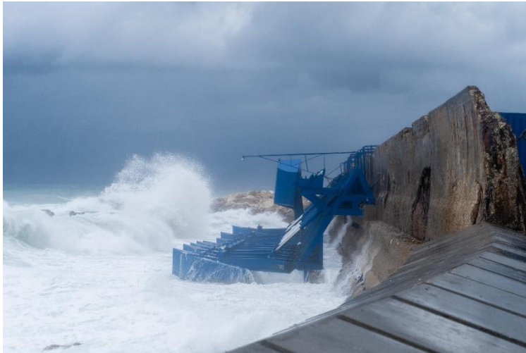
Figure 1- Eco Wave Power's Operational Project in Israel.

While utility-scale wave energy converters (WECs) are scheduled to be connected to the U.S. mainland grid over the next couple of years, California should pursue integrating full-scale onshore, nearshore, and offshore marine energy projects into its electricity mix starting in the late 2020s to avoid overbuilding energy storage and transmission infrastructure at an unnecessarily high cost. With 100 MW of marine energy capacity by 2030 and a growth rate thereafter similar to that of California solar in the 2010s, the state should have multiple GW of marine energy capacity by 2040.