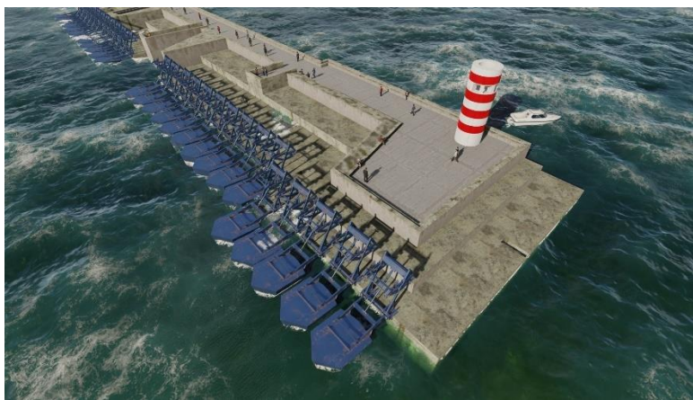
Figure 3- Eco Wave Power 1MW Project Illustration in Portugal.

Most ports contain existing marine structures such as breakwaters and jetties, on which the onshore wave energy technologies can be installed, which makes ports extremely suitable locations for the implementation of onshore wave energy technologies. By implementing onshore wave energy technologies in their facilities, ports can benefit directly from a renewable source in the vicinity of their operations, which does not require any input material such as coal or oil and which can provide them with steady access to clean electricity, thereby potentially allowing them to drastically reduce their GHG emissions and electricity costs. An example of such a project is Eco Wave Power's 20MW Concession agreement, entered with the Port of APDL, in the city of Porto, in Portugal.