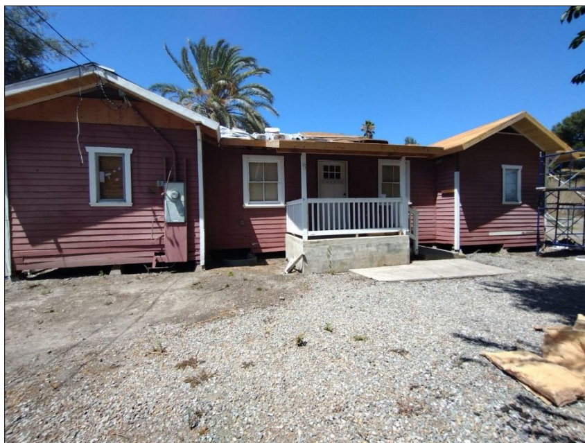
Figure 2: Multi-Purpose Building, view west.