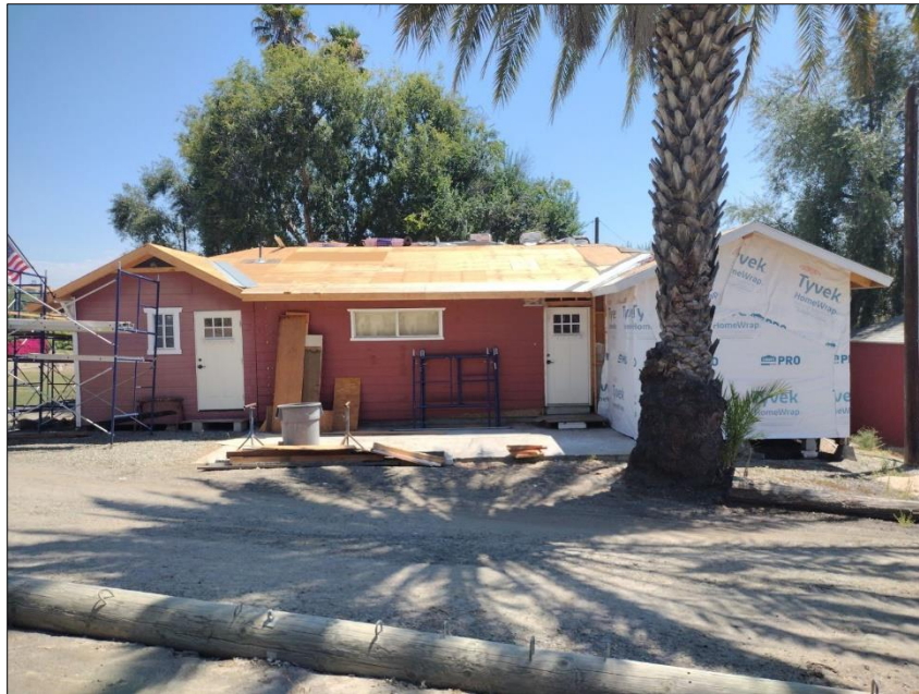
Figure 1: Multi-Purpose Building, view east.

*Resource Name or #: P-30-12-176642 Bathgate Ranch Property Historic District