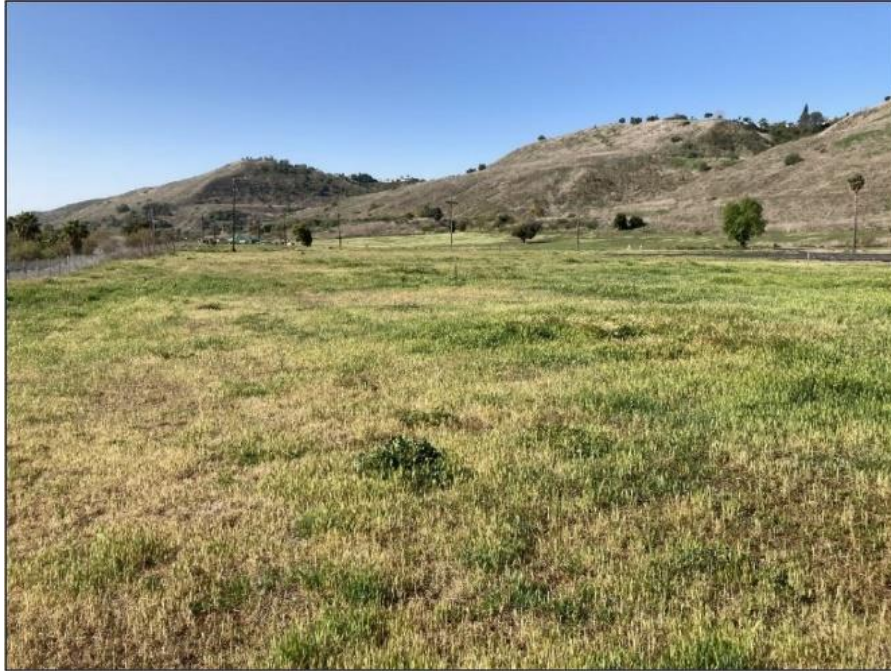
Figure 3: Previous location of Bathgate Ranch citrus trees, view to southwest.

*Resource Name or #: P-30-12-176642 Bathgate Ranch Property Historic District