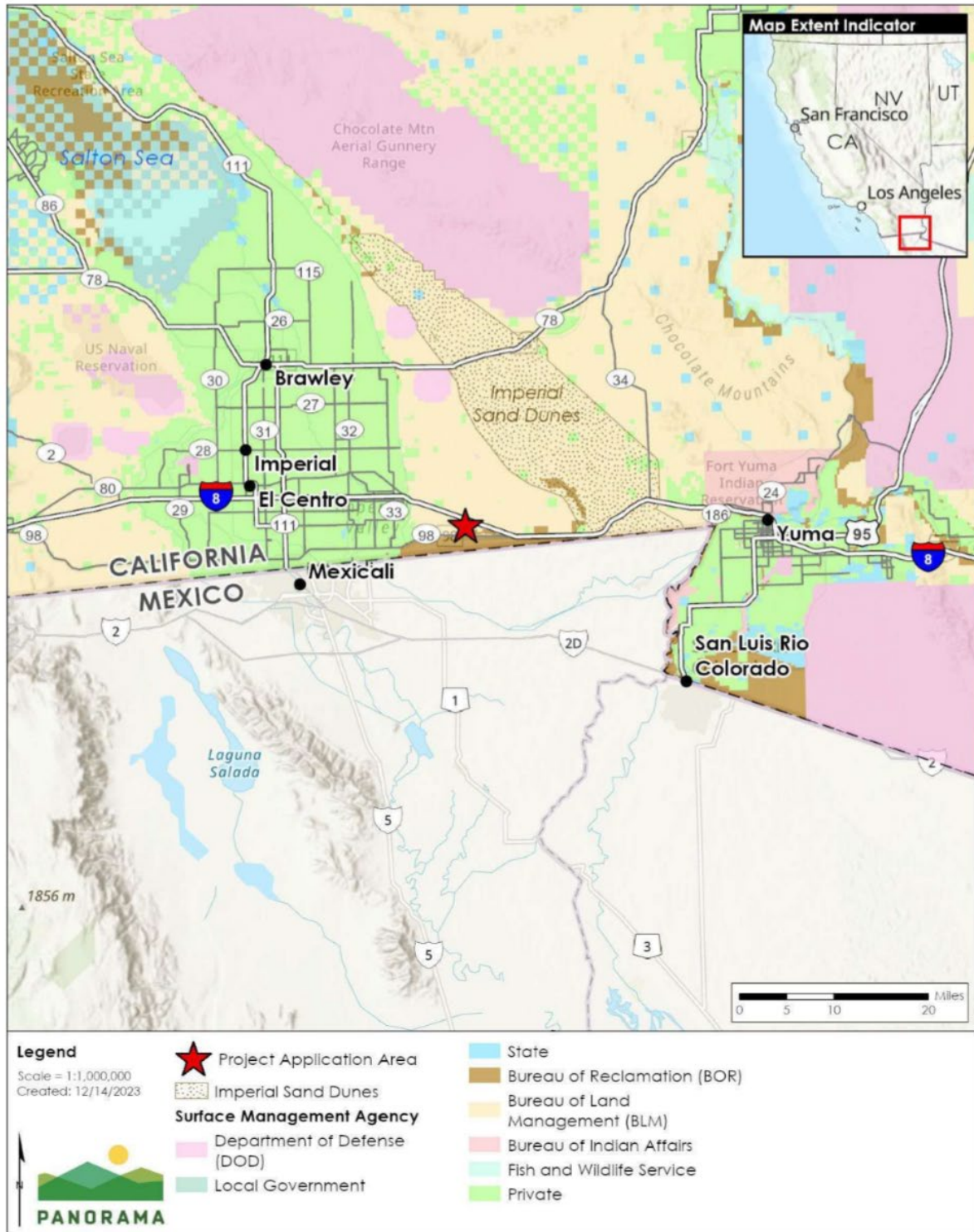
Figure 1.3-1 Regional Setting