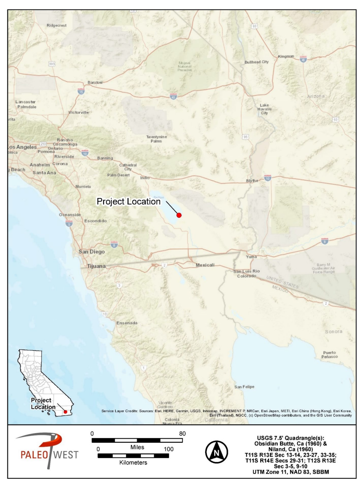
Figure 1-1. Project vicinity map.