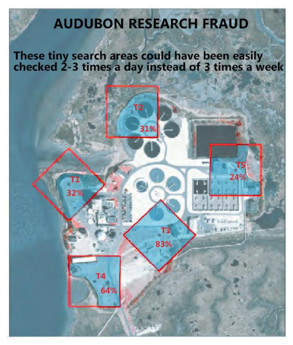
Figure 6. Atlantic City Utilities Authority (ACUA) study site showing actual survey areas (shaded in light blue) used during collision incident surveys. Low lying marsh areas within a turbine's search area were not surveyed because tidal inundation regularly prevented access to these sections. To some extent this was the case at all turbine sites except at turbine #3. If a building fell within the search area, rooftops were surveyed when accessible. Clarifying and mixing ponds, and other water bodies were also surveyed using walkways, gangways and dikes to gain access. Collision incident estimates will be corrected for the proportion of the total area around each turbine that was searched.