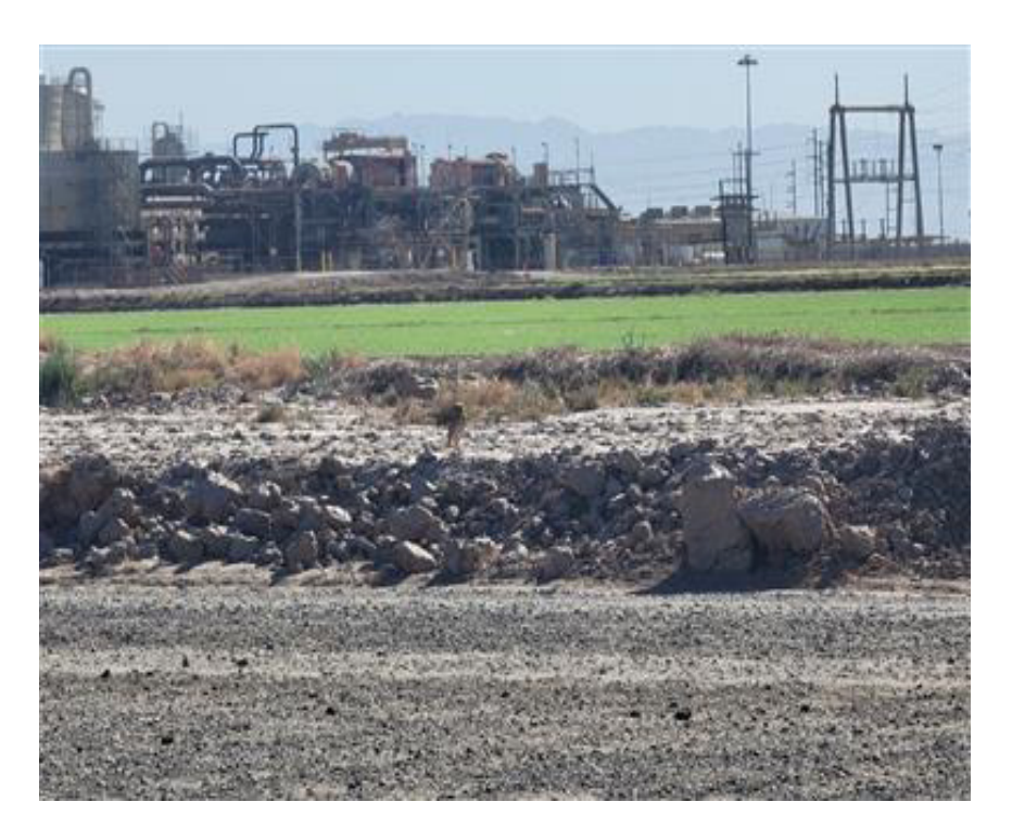
Photograph 8: Representative photo of owl located within developed land.