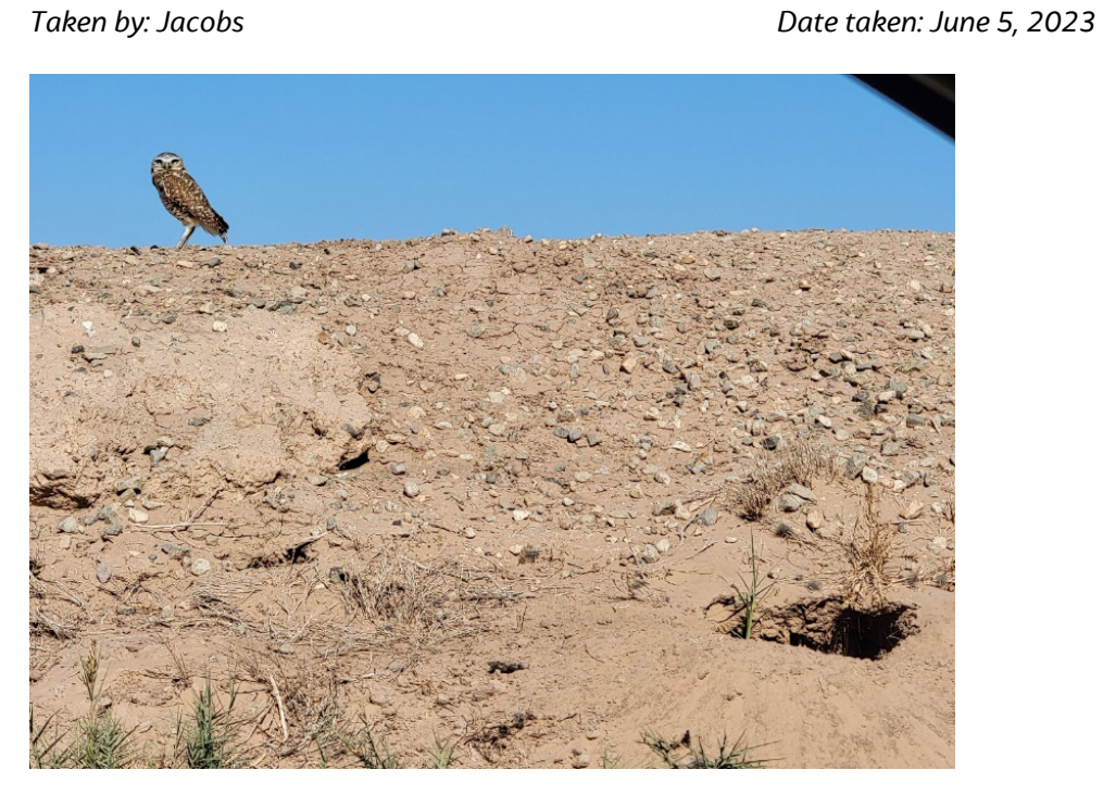
Photograph 3: BUOW_38 - Owl at a burrow located on the west side of ENGP along Cox Road.

Date taken: June 6, 2023