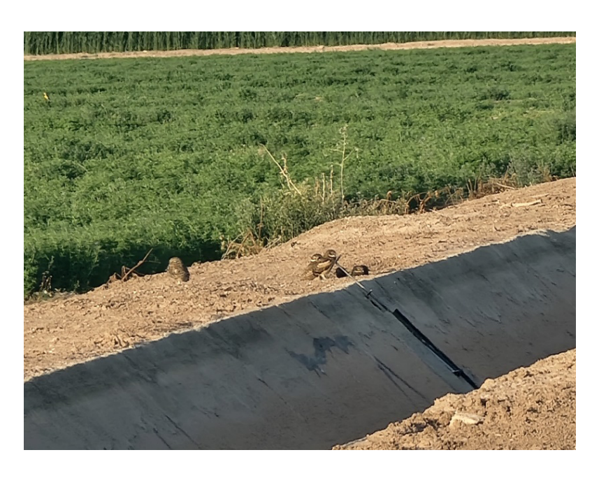
Photograph 4: BUOW_23 - Multiple owls at a burrow in ENGP on Grubel Road.