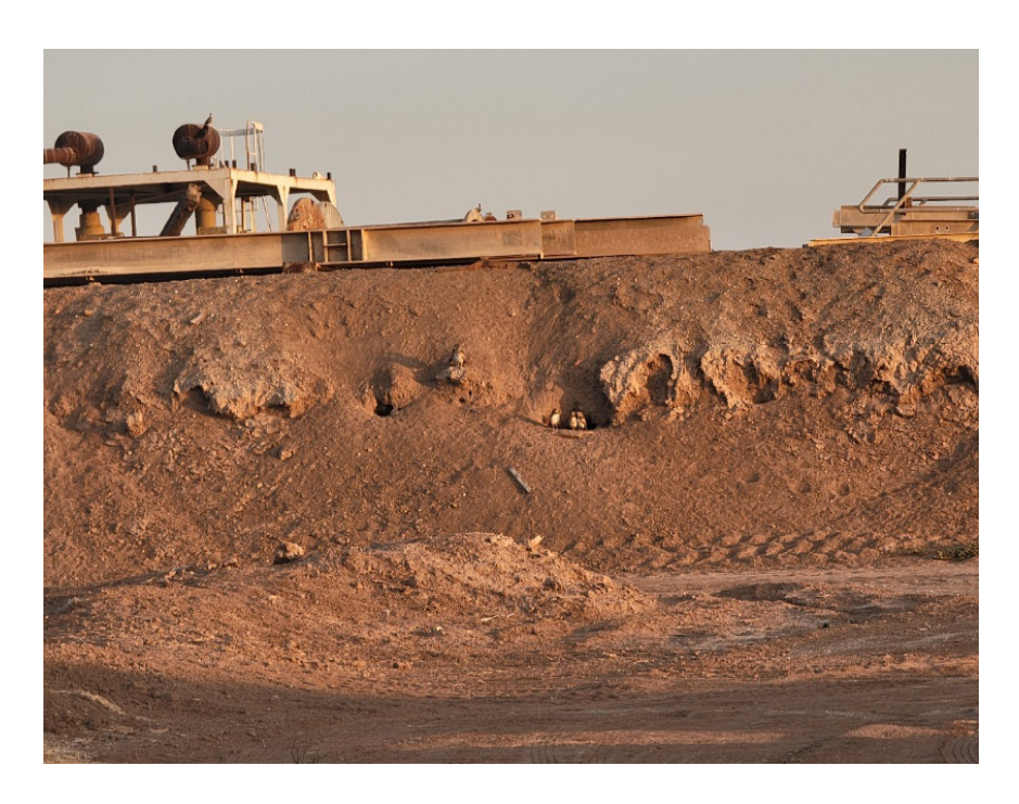
Photograph 6: BUOW_14 - Multiple owls at a burrow east of Boyle Road. This burrow is along a shared construction area for all three projects, BRGP, ENGP, and MBGP.