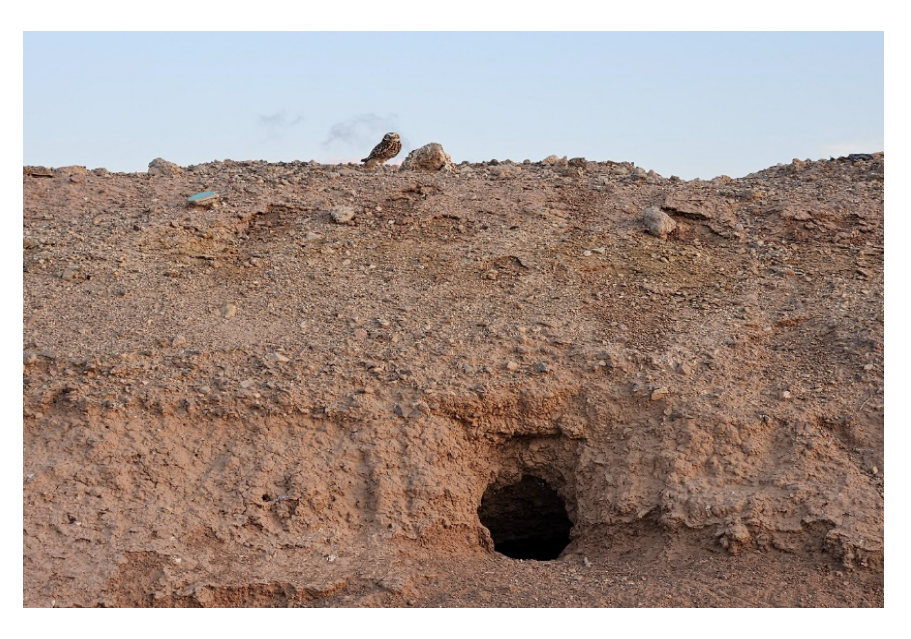
Photograph 7: BUOW_17 - Owl at a burrow east of Boyle Road south of McNerney Road. This burrow is along a shared construction area for all three projects, BRGP, ENGP, and MBGP.