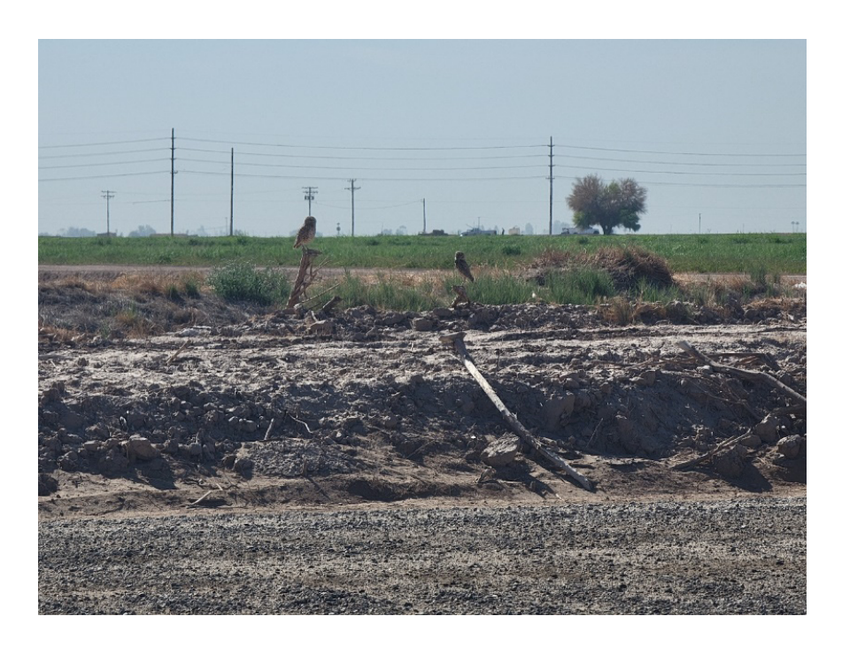
Photograph 2: BUOW_13 - Two owls perched on branches on Boyle Road. This is along a shared construction area for all three projects, BRGP, Elmore North Geothermal Project (ENGP), and Morton Bay Geothermal Project (MBGP).