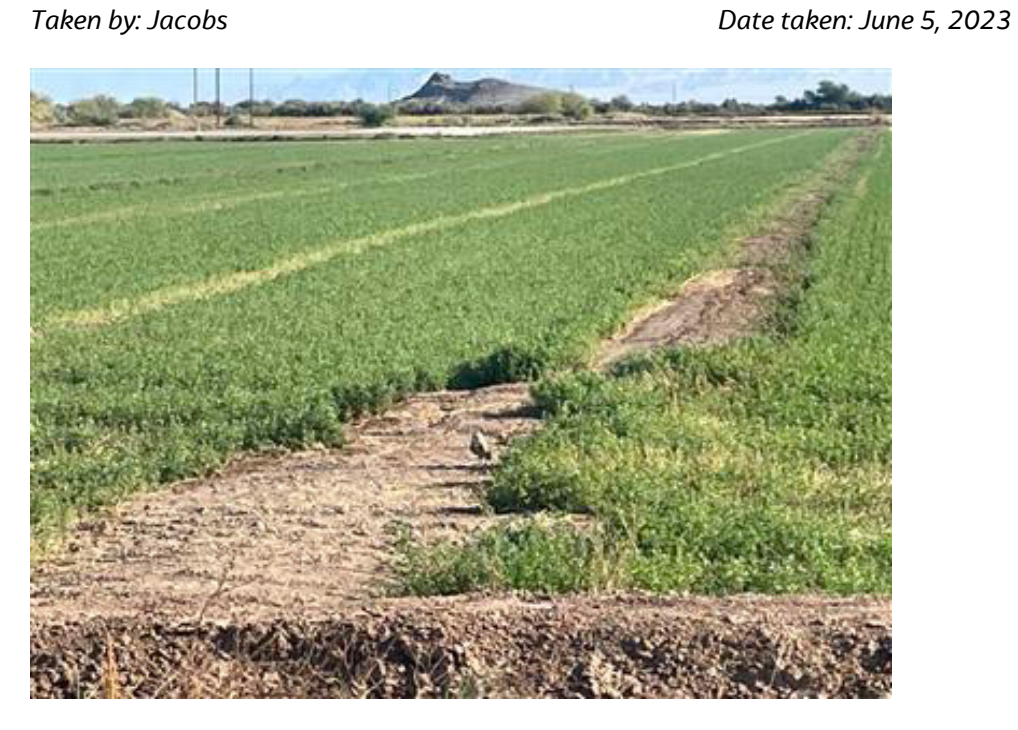
Photograph 9: Representative photo of owl in agricultural land.

Date taken: June 5, 2023