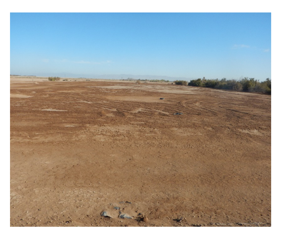
Photograph 10: Representative photo of disturbed land.

Date taken: June 5, 2023