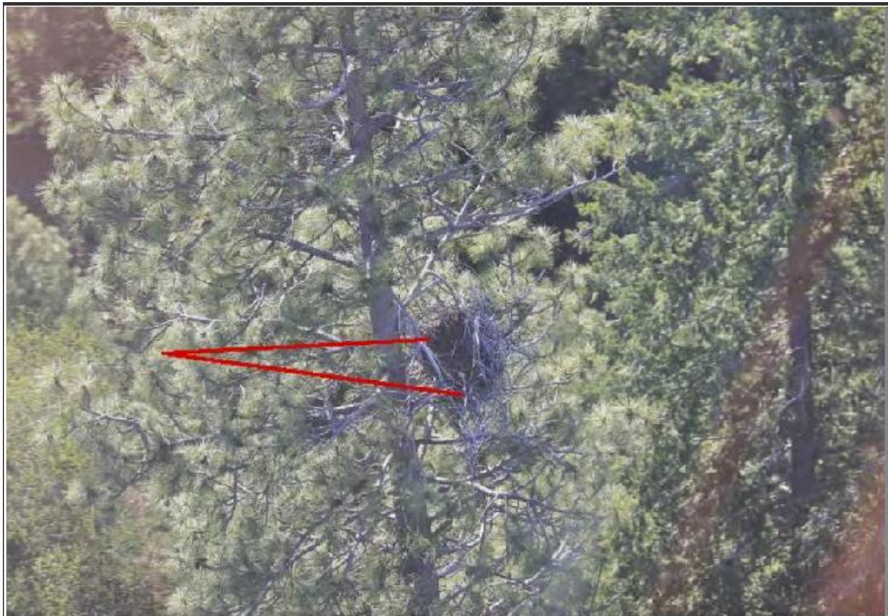
Nest 299, located approximately 2.9 miles east of the Fountain Wind Project.

“During eagle nest surveys conducted within a 10-mi radius of the Project area, 11 occupied bald eagle nests were documented, with the closest nests to the Project area located at Lake Margaret, approximately 4.7 km (2.9 mi) east of the Project, and along the Pit River approximately 6.8 km (4.2 mi) north of the Project.”