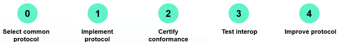
Figure 2: Any link in the charging ecosystem achieves link interoperability by following the above five step process. Broad interoperability is achieved when all links achieves link interoperability.

A link achieves interoperability when industry parties on both ends of the link progress through the following steps. [Examples of actions that can be taken for Link B are provided in brackets.] Each step below also describes existing CEC actions supporting activities for that step. Broad interoperability is achieved when all links achieve link interoperability.