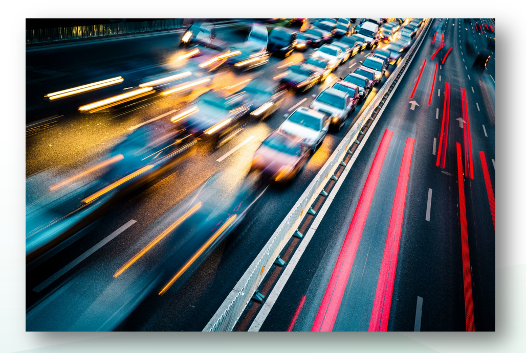
85,000 internal combustion engines