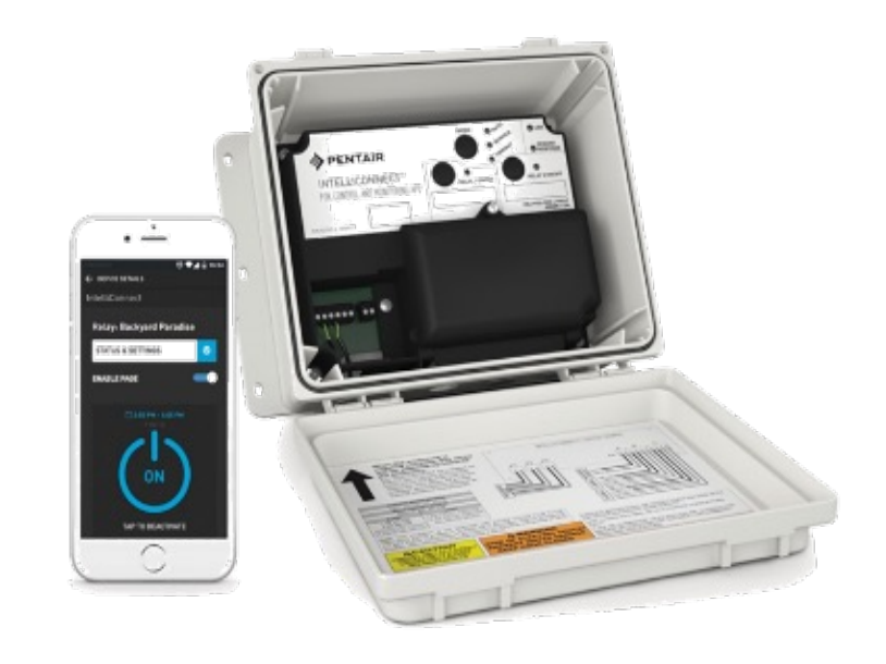
Equipment in Single Enclosure