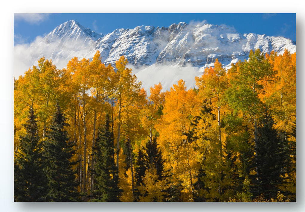
17 million mature trees