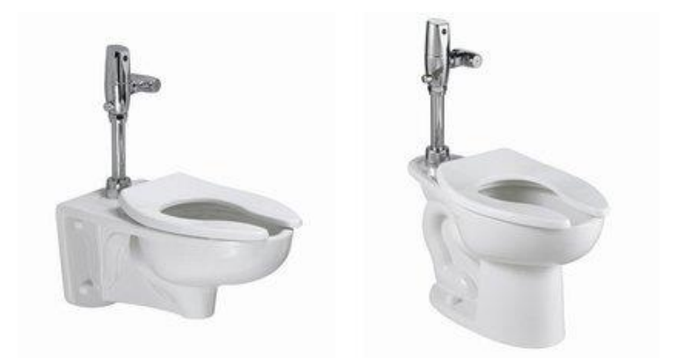
Figure 4: Wall- and Floor-Mounted Flushometer Valve Water Closets

usually requires a one-inch diameter water supply line. Flushometer valve water closets provide a quick flush and a rapid recovery but are also generally quite noisy. Flushometer valve water closets can be wall or floor mounted, as shown in Figure 4. The bowl and the matched valve are frequently sold separately.