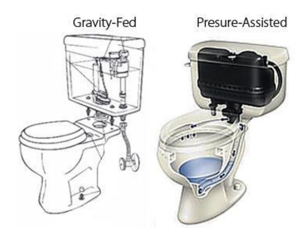
Figure 1: Gravity and Pressure-Assist Tank-type Water Closets

Pressure-assist (flushometer tank) water closets are less common in residential applications than gravity models. Pressure-assist water closets contain a vessel inside the ceramic tank (Figure 1). Building water pressure from the water supply line pressurizes this vessel. As water refills, it enters the vessel and compresses the air. The flush action rapidly decompresses air and forces water from the vessel into the bowl and trapway, creating the siphon. Pressure-assist models generally require a minimum water supply pressure of 15-40 pounds per square inch (psi) to operate well. The downside to pressure-assist water closets is they are generally more expensive to purchase, and the flush action is often louder than in gravity models.