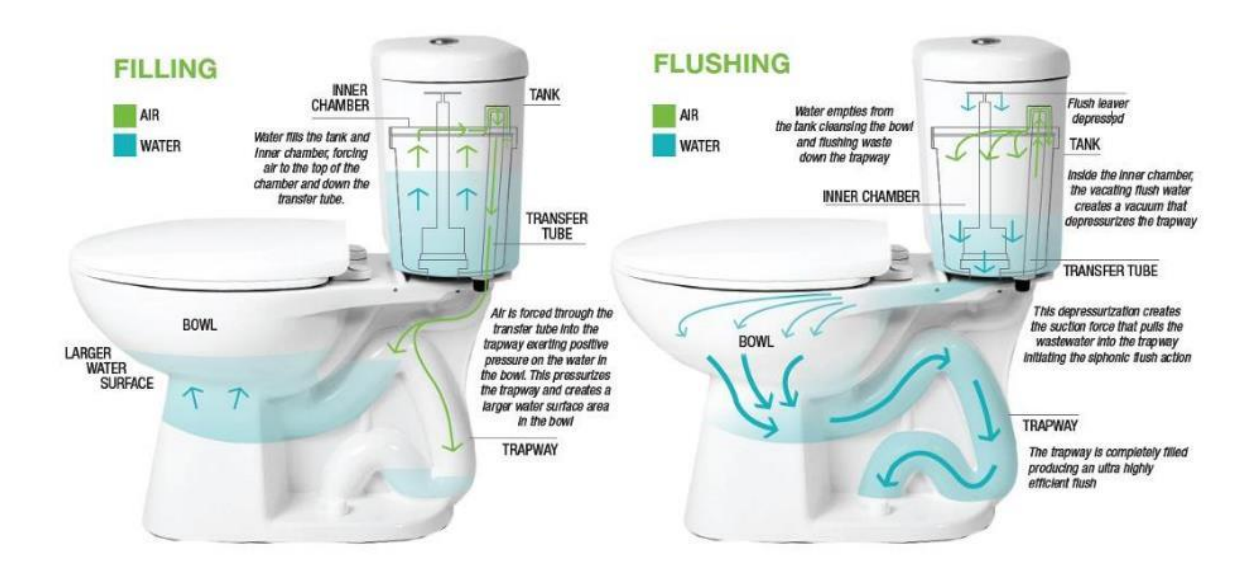
Figure 3: Vacuum-Assist Water Closet

The vacuum-assist water closet design uses a pressurized air pocket that suspends the water in the bowl within a trapway between the bowl and the exit to the drain line. When the water closet is flushed, the air in the trapway depressurizes and creates a suction force that pulls wastewater out of the bowl. Figure 3 provides a schematic of a vacuum-assist model.