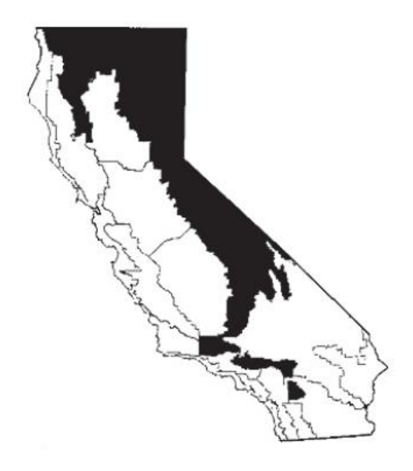
Figure 1: Climate Zone 16 (Pacific Energy Center 2006)

The current code requirement for slab perimeter insulation has been present in Title 24, Part 6 since at least the 2005 version of the code.