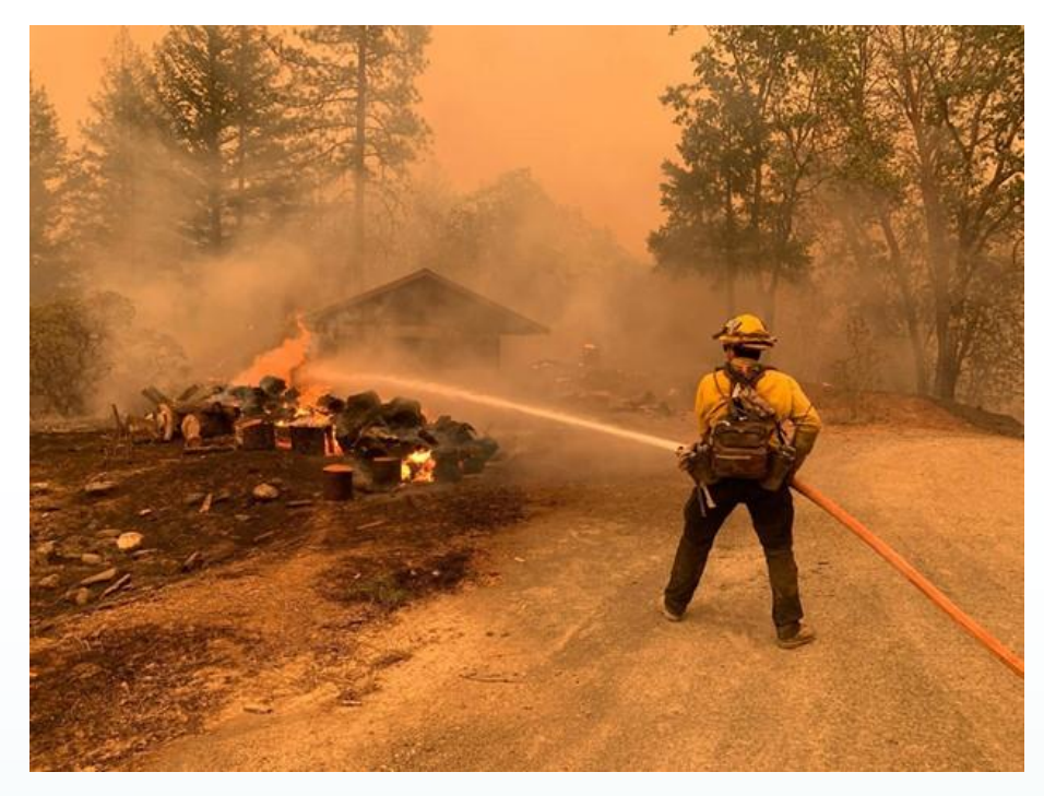
Firefighter at the 2021 California Monument Fire.