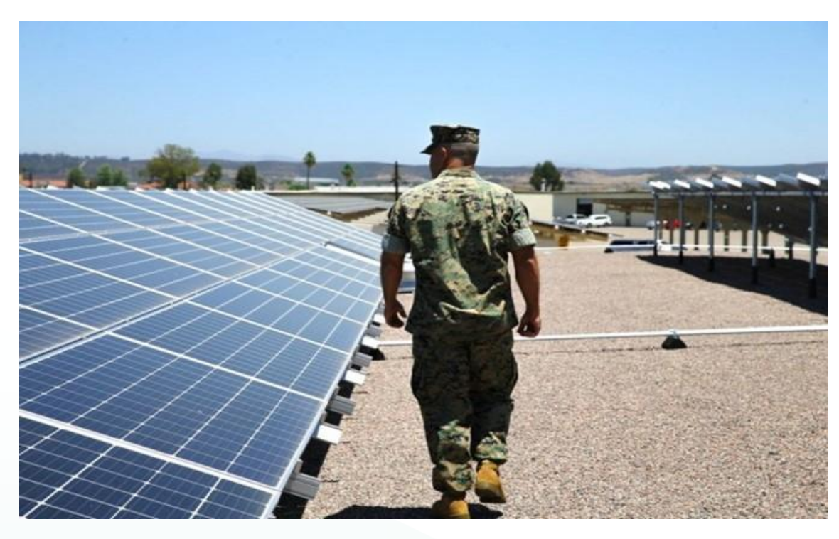
A United States Marine walks by solar panels at MCAS Miramar