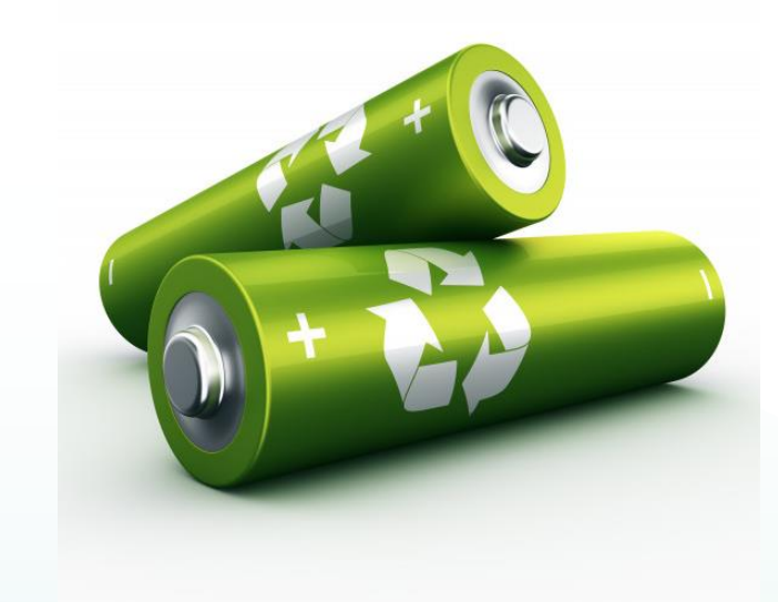
Green Batteries and a Circular Economy (artist rendering)