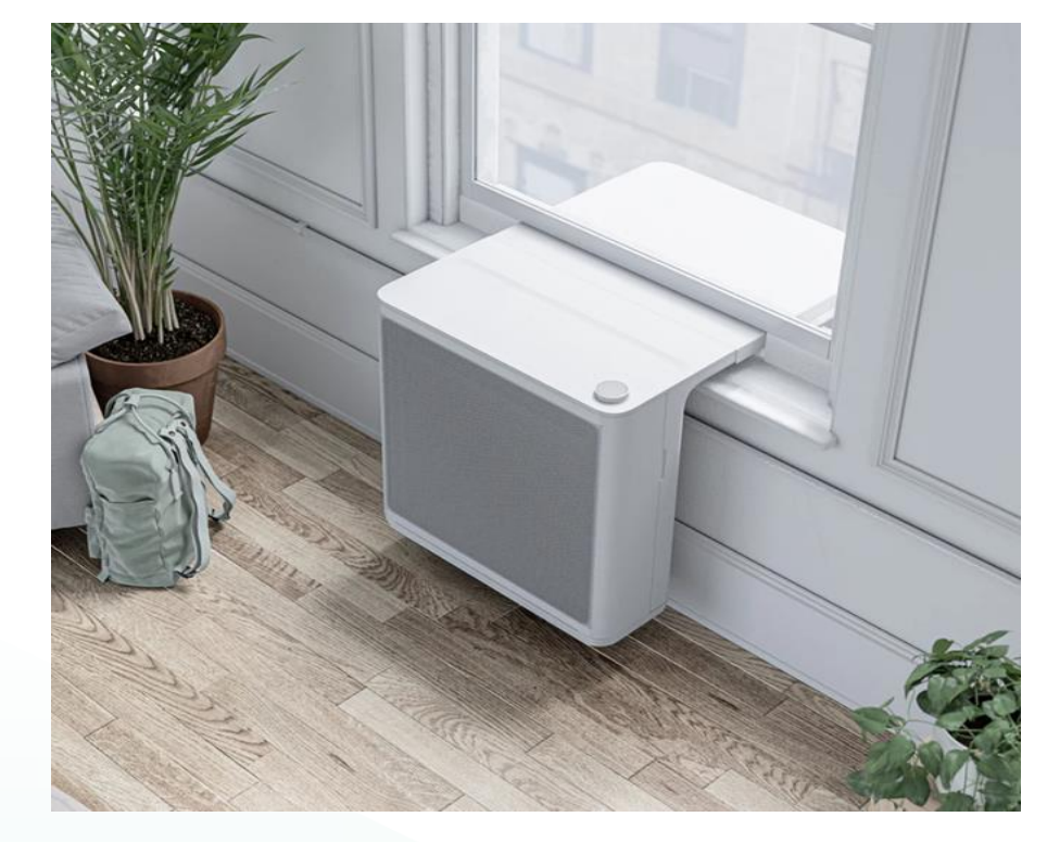
Gradient fits below the windowsill, allowing for a better view than traditional in-window AC units.