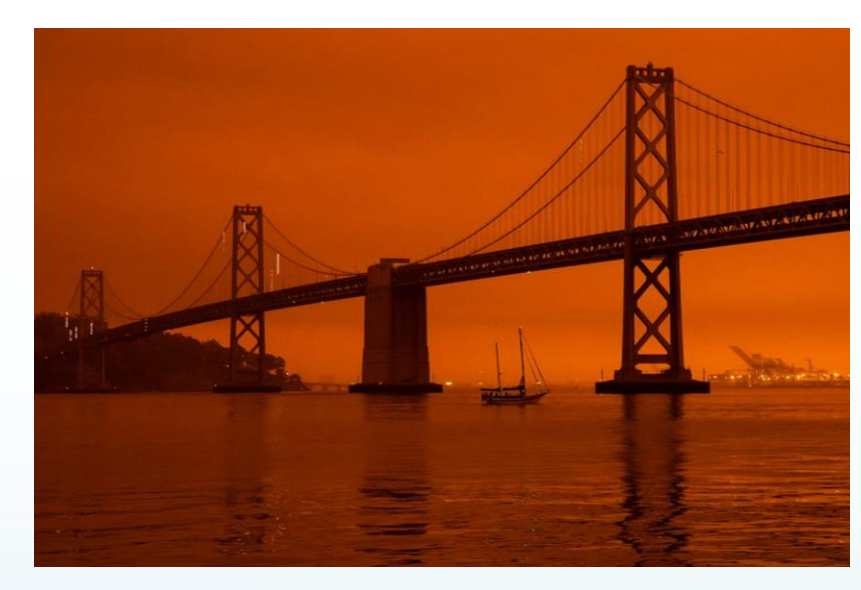
San Francisco Bay Bridge during August 2020 Heat Storm

Enabling the Electrification of Everything