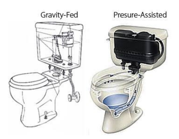
Figure 1: Gravity and Pressure-assist Tank-type Water Closets

Pressure-assist (flushometer tank) water closets are less common in residential applications than gravity models. Pressure-assist water closets contain a vessel inside the ceramic tank (Figure 1). Building water pressure from the water supply line pressurizes this vessel. As water refills, it enters the vessel and compresses the air. The flush action rapidly decompresses air and forces water from the vessel into the bowl, creating the siphon. Pressure-assist models generally require a minimum water supply pressure of 15-40 pounds per square inch (psi) to operate well. The downside to pressure-assist water closets is they are generally more expensive, and the flush is louder than gravity models.