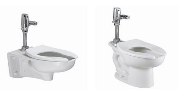
Figure 3: Wall- and Floor-mounted Flushometer Valve Water Closets

Flushometer valve water closets are common in medium- to high-usage commercial and industrial applications. The flush water comes directly from the building water supply instead of a pressurized tank. The flush valve controls the volume of water that enters the bowl to activate the flush and restore the water level following the flush. The water pressure for this design is between 20 and 80 psi and usually requires a one-inch plumbing line. Flushometer valve water closets provide quick flush and rapid recovery but are also quite noisy. Flushometer valve water closets can be wall or floor mounted, as shown in Figure 3. The bowl and the matched valve are frequently sold separately.