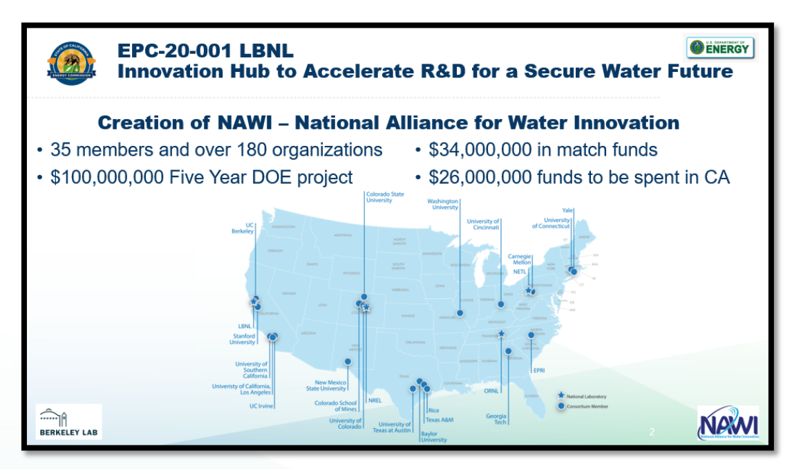
(Example of EPIC Cost Share)