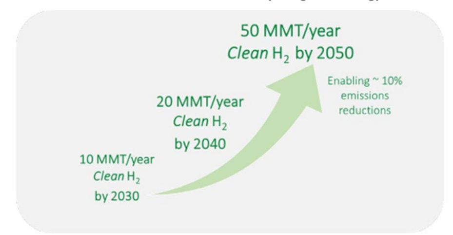
Figure 1: U.S. DOE estimate of the opportunity for clean hydrogen in the U.S. (Figure 5 as published in the DOE Draft National Clean Hydrogen Strategy & Roadmap)<sup>6</sup>

SoCalGas recommends the CEC refer to and consider other federal and state-level hydrogen demand estimates provided by the U.S. DOE, CARB's Final Scoping Plan, as well as ARCHES<sup>4</sup> in its models of future hydrogen demand. The State-led ARCHES partnership is prospectively expressing broad geographic and economy-wide use of hydrogen as it advances hydrogen hub development and deployment. The effort envisions, major deployment clusters in the Los Angeles Basin and Bay Area and extend into the Central Valley, Inland Empire, and other regions (and possibly neighboring states) with high renewable resources, geologic storage possibilities, key transportation corridors, and need for clean energy and reduced pollution.<sup>5</sup> The ongoing and expanding use of and interest in hydrogen as a low carbon energy source strongly suggests that the Draft 2022 IEPR Update may be underestimated future hydrogen demand and utilization. SoCalGas also requests the CEC run new Demand Forecast scenarios to include BIL and IRA assumptions for a revised hydrogen demand forecast.