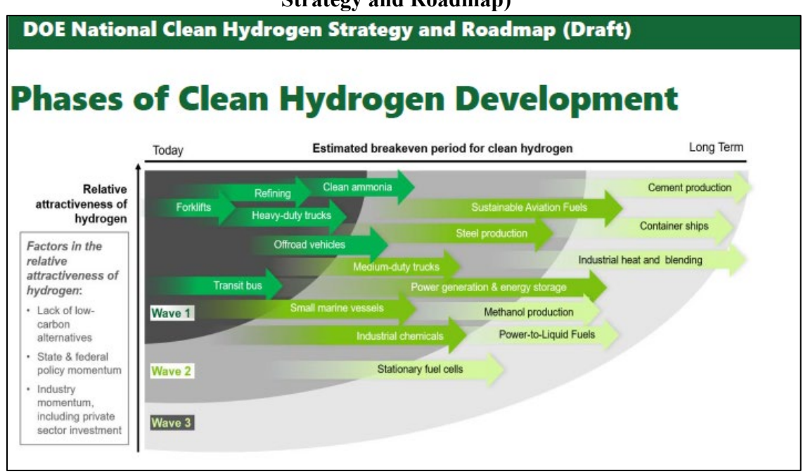
Figure 4: U.S. DOE graphic of predicted timeline flow for clean hydrogen development and deployment (Figure 39 as published in the U.S. DOE Draft National Clean Hydrogen Strategy and Roadmap)<sup>20</sup>