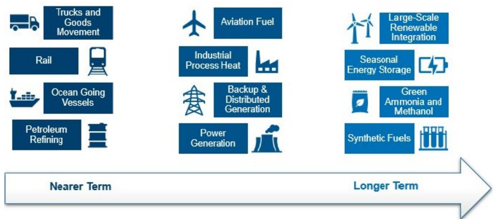
Figure 3: Draft 2022 IEPR Update representation of future opportunities for clean hydrogen (Figure 22 as published in the Draft 2022 IEPR Update)<sup>18</sup>

Along the same lines as with the CEC's future hydrogen demand forecast, SoCalGas suggests the CEC consider and reference other sources such as the U.S. DOE in its assessment of future opportunities for hydrogen decarbonization. For example, the U.S. DOE has compiled a comprehensive roadmap describing its estimate of the phases of clean hydrogen development opportunities in its National Clean Hydrogen Strategy and Roadmap report. <sup>19</sup> This is shown in Figure 39 of the report (shown as Figure 4 below). In this figure, U.S. DOE envisions three application adoption phases or "waves" for clean hydrogen use in the United States for near and longer-term deployment based on the relative attractiveness in each end-use application. Consideration and integration of the U.S. DOE Figure 39 would help align strategy around hydrogen opportunities between California and U.S.